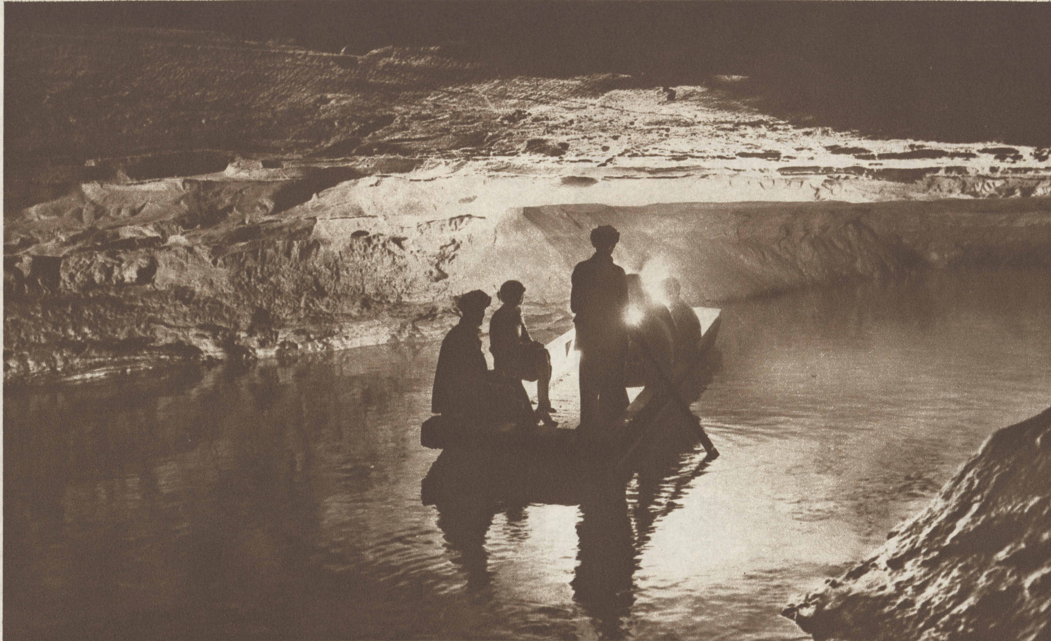
BOATING 360 FEET UNDERGROUND IN MAMMOTH CAVE, KENTUCKY.