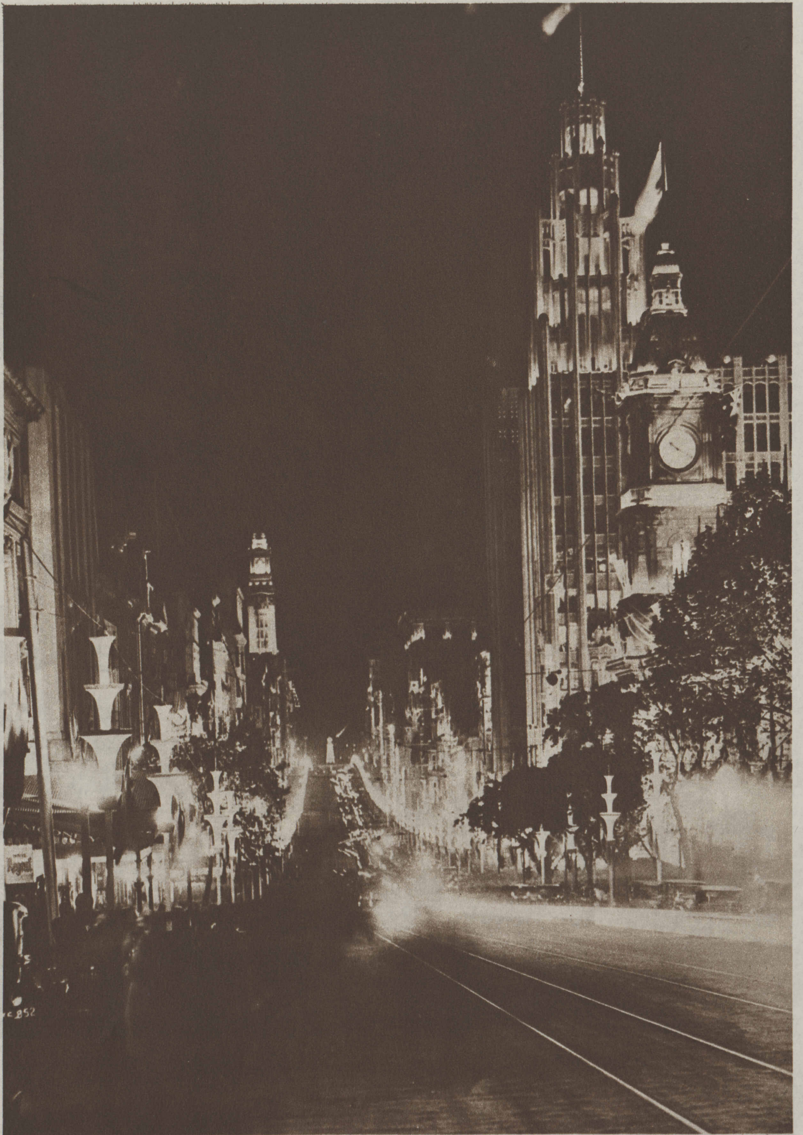
FESTIVE ILLUMINATION marks the centenary celebration at Melbourne, Australia.