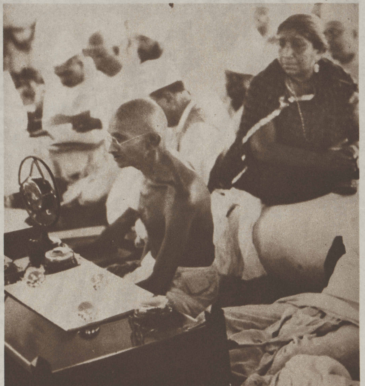
MAHATMA GANDHI AT THE MICROPHONE.