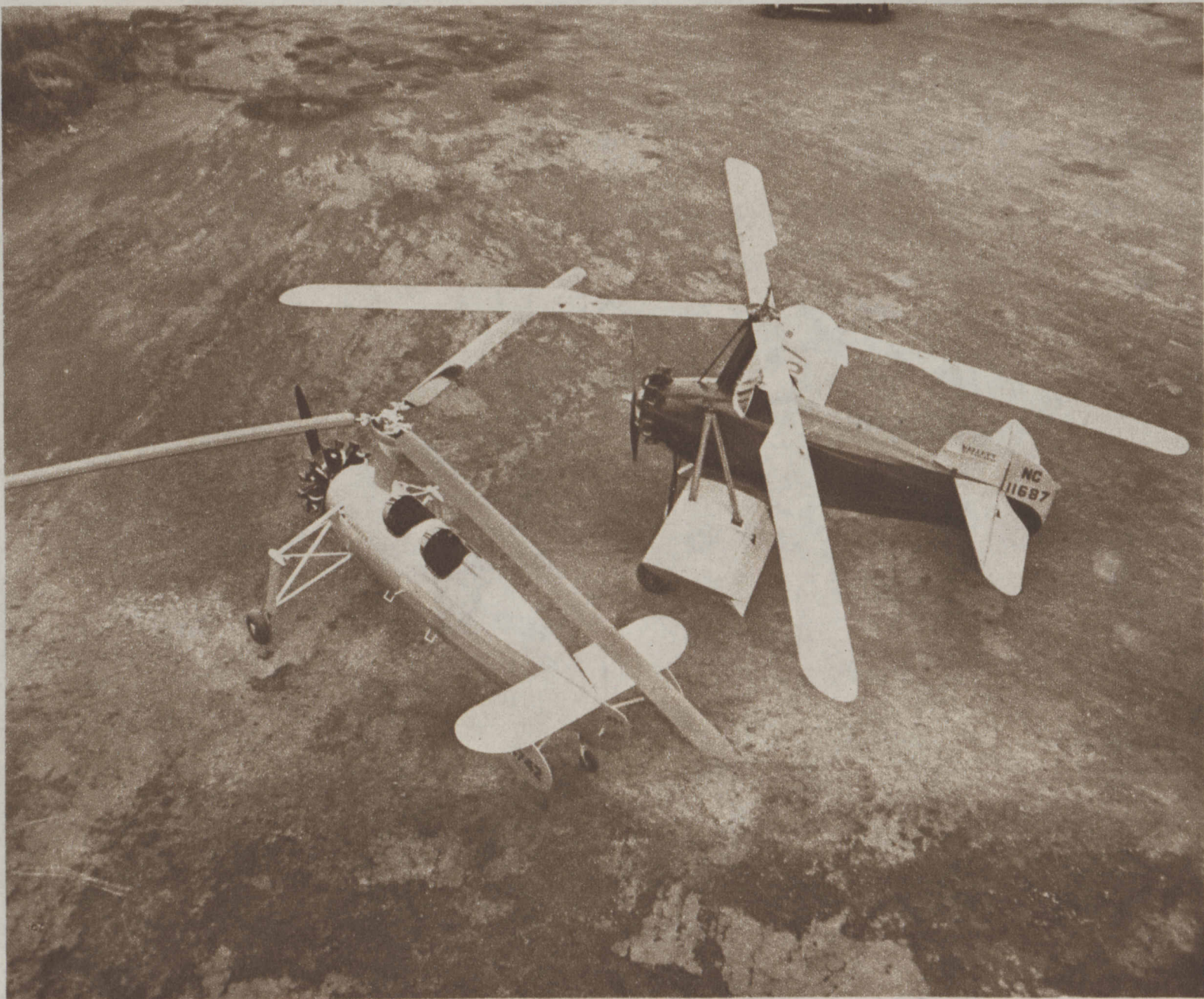
WINGLESS AND WINGED AUTOGIROS AT CAMDEN, N. J.