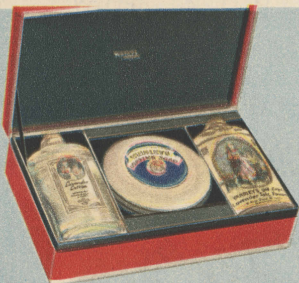
BELOW, "The Gentleman's Package," a fine gift for men. It contains one bowl of Shaving Soap, one bottle of Shaving Lotion and a tin of Talcum Powder. The price is $3.25.