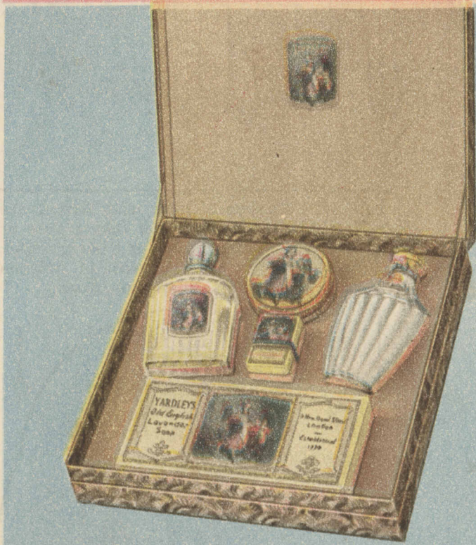
ABOVE, a set for women which contains Yardley's Old English Lavender Soap, Face Powder, Lavender, Compressed Sachet Blossoms and Talcum Powder. The price is $6.50.

The gift sets are as simple or as elaborate as you wish, ranging from $1.25 to $12. Packaged smartly in green and gold, they speak softly of old-world sophistication. Yardley & Co., Ltd., 8 New Bond Street, London; 452 Fifth Avenue at Fortieth Street, New York City; also Paris and Toronto.