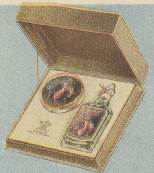
ABOVE, two appreciated Yardley toiletries appear in this gift box—the famous Lavender and a Face Powder Compact. A package whose appeal is all out of proportion to its reasonable price of $2.