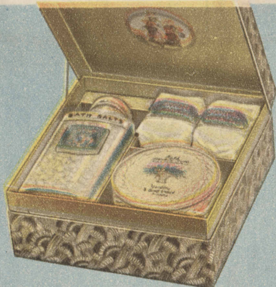
ABOVE, a luxury to make an occasion of one's bath: Soothing lavender bath crystals; dusting powder of the finest texture, with lamb's wool puff; two cakes of Yardley's English Lavender Soap. The price is $4.