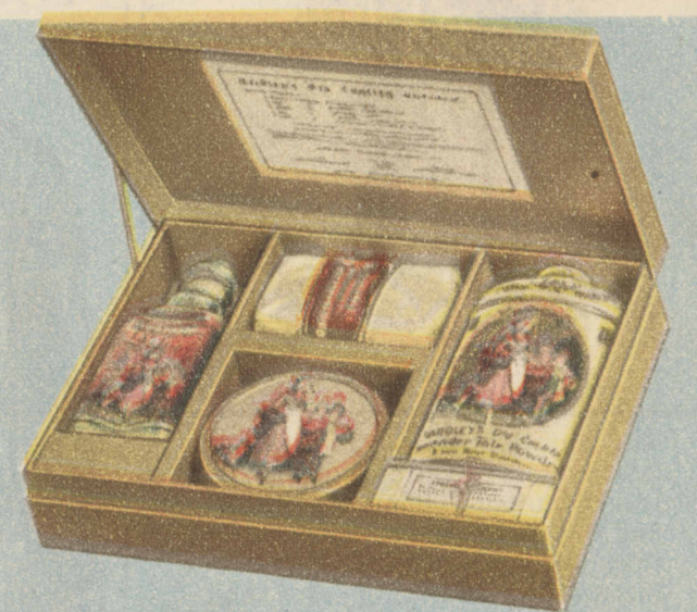
BELOW, soap, face powder, talcum and lavender. A delightful ensemble for the friend one wishes to remember quite specially. Only $3.25.