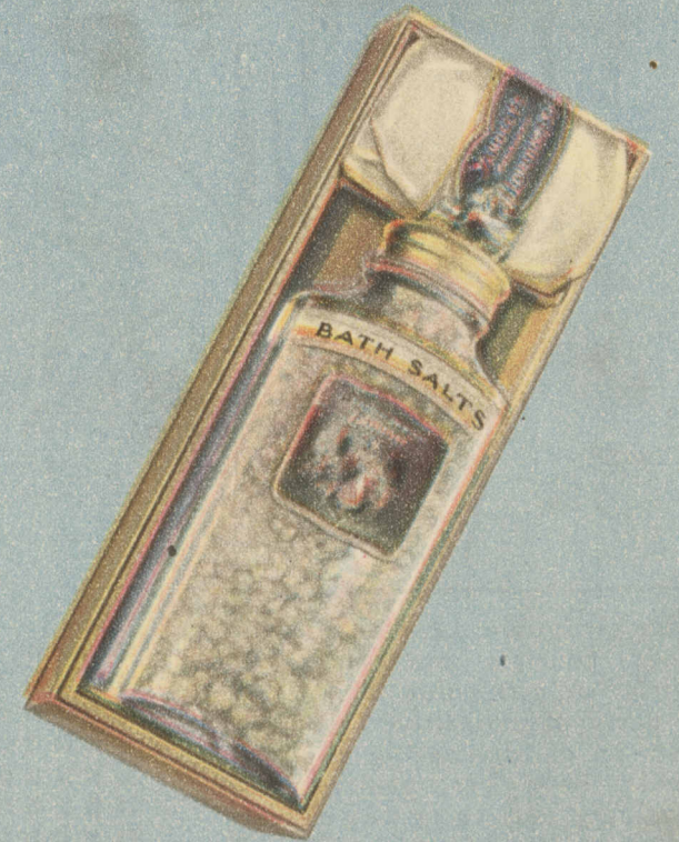
ABOVE, the refreshing "Salts and Soap" set. It contains a large bottle of Bath Salts Crystals and one cake of Soap. The price is $1.50.