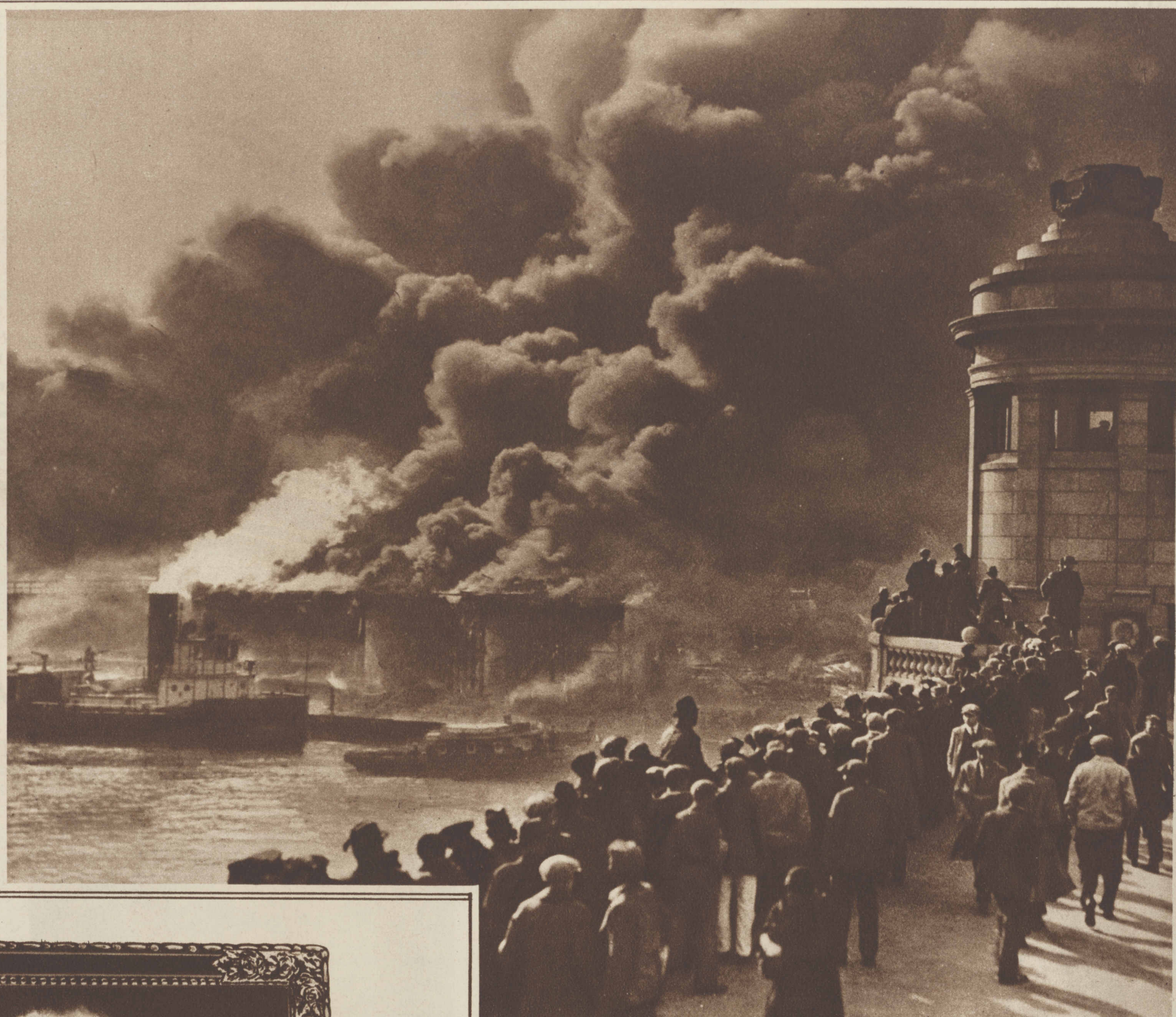
THE SPECTACLE OF FIRE THRILLS CHICAGO CROWDS—The south side of the loop is darkened with a gigantic pall of smoke by flames which destroyed the ramp leading into the Pere Marquette yards from Roosevelt road and the river, burned a grain warehouse and a string of freight cars, and tied railroad and street traffic into a knot. Fireboats which played a major role in extinguishing the conflagration added picturesqueness to the sight.

ENNA JETTICK BOOT SHOP 24 East Adams St.