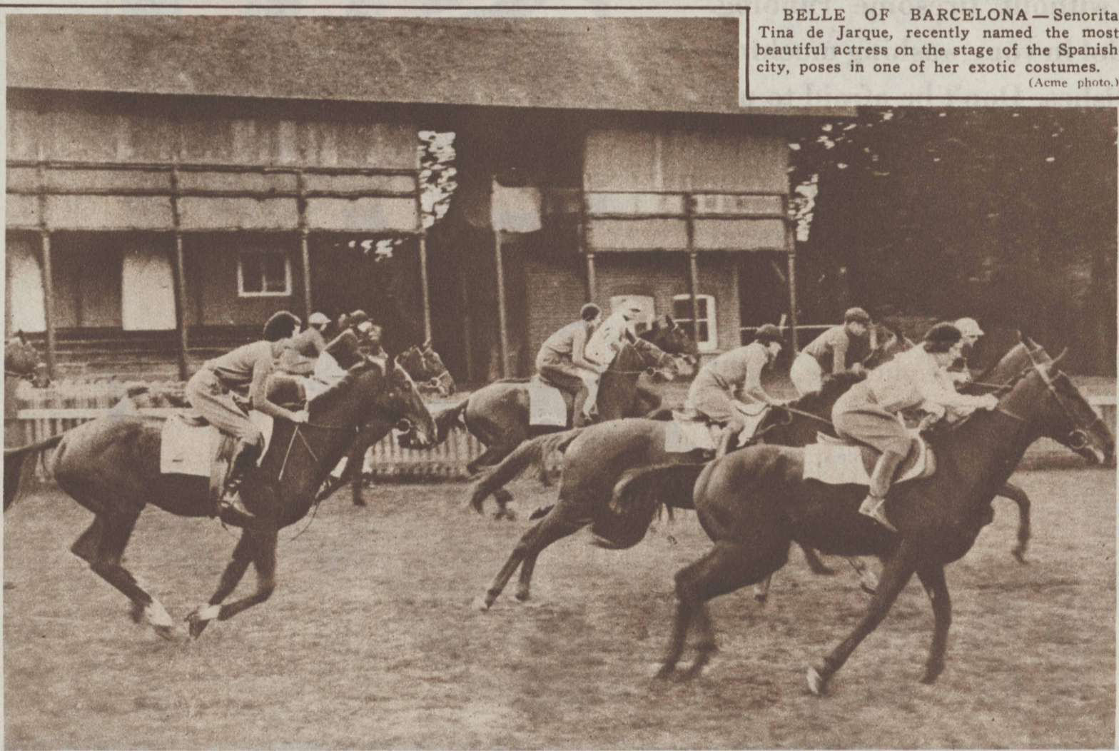
FIVE WOMEN entered the historic Town Plate race over the Newmarket course in England, competing with men, and one of their number won the event. The start of the race is shown in this picture.