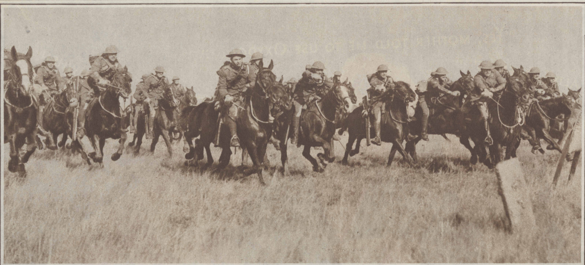
THE FIFTH INNISKILLING DRAGOON GUARDS in a charge during exercises at Aldershot, England.