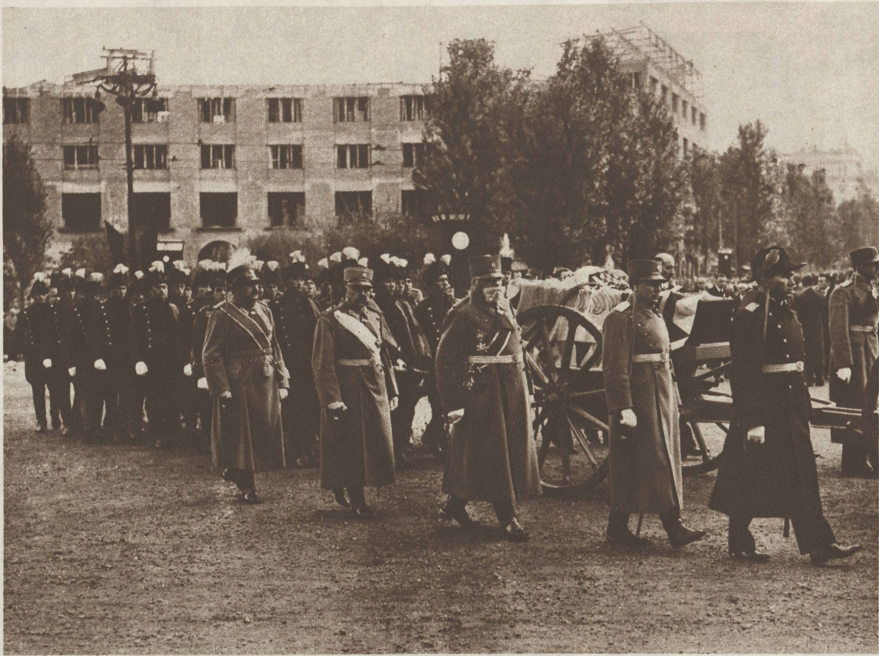
A GORGEOUSLY UNIFORMED GUARD OF HONOR escorts Jugo-Slavia's slain king to his grave.