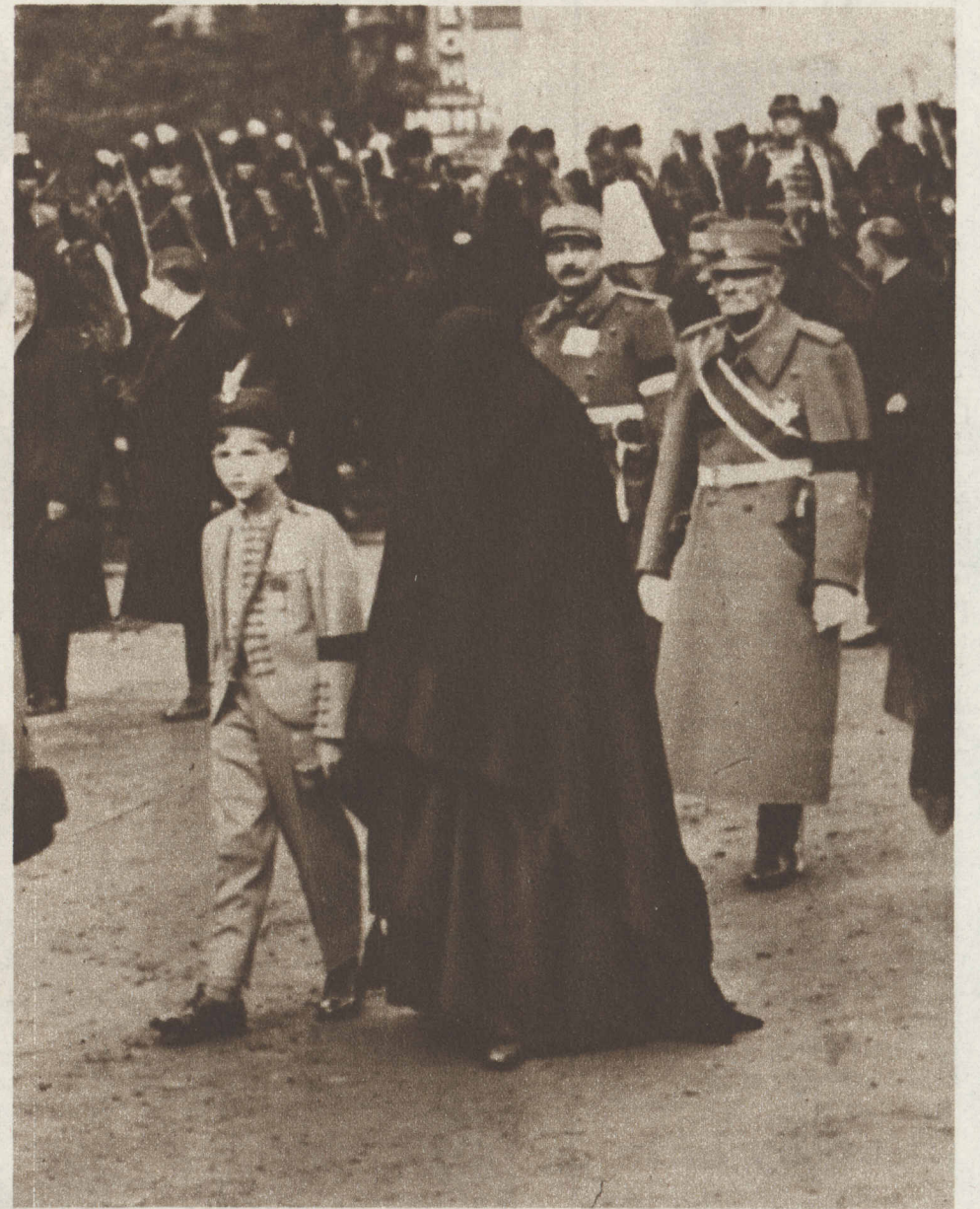
THE BOY KING, PETER, and his widowed mother, Dowager Queen Marie, in the funeral procession of King Alexander.