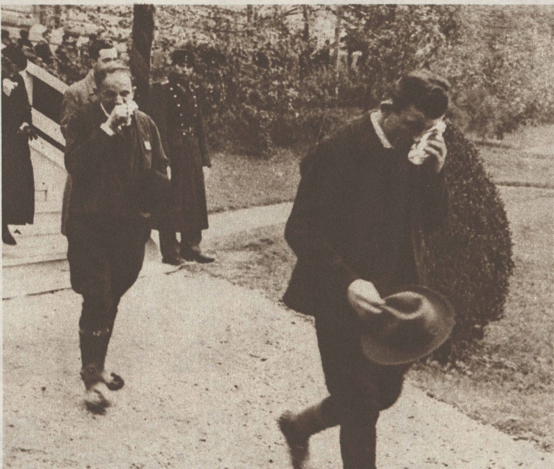
PEASANTS WEEP as they depart from the royal palace after viewing the body of Alexander.