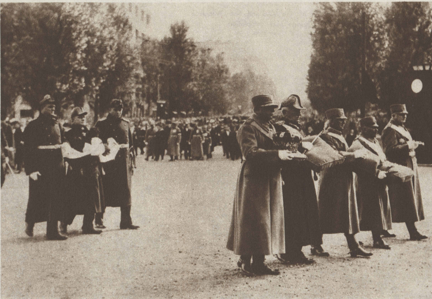
EMBLEMS OF ROYALTY follow the body of King Alexander through Belgrade streets.