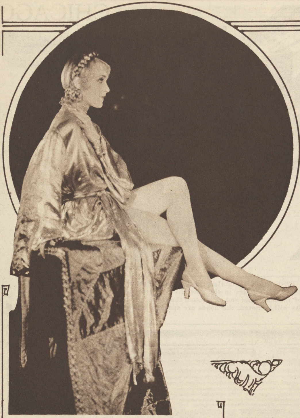
CAROL LOMBARD looks like a bit of statuary here, doesn't she? Also, she appears to be on a pedestal. There was no reason for the pose that we know of, except to provide a pretty picture for fan albums.