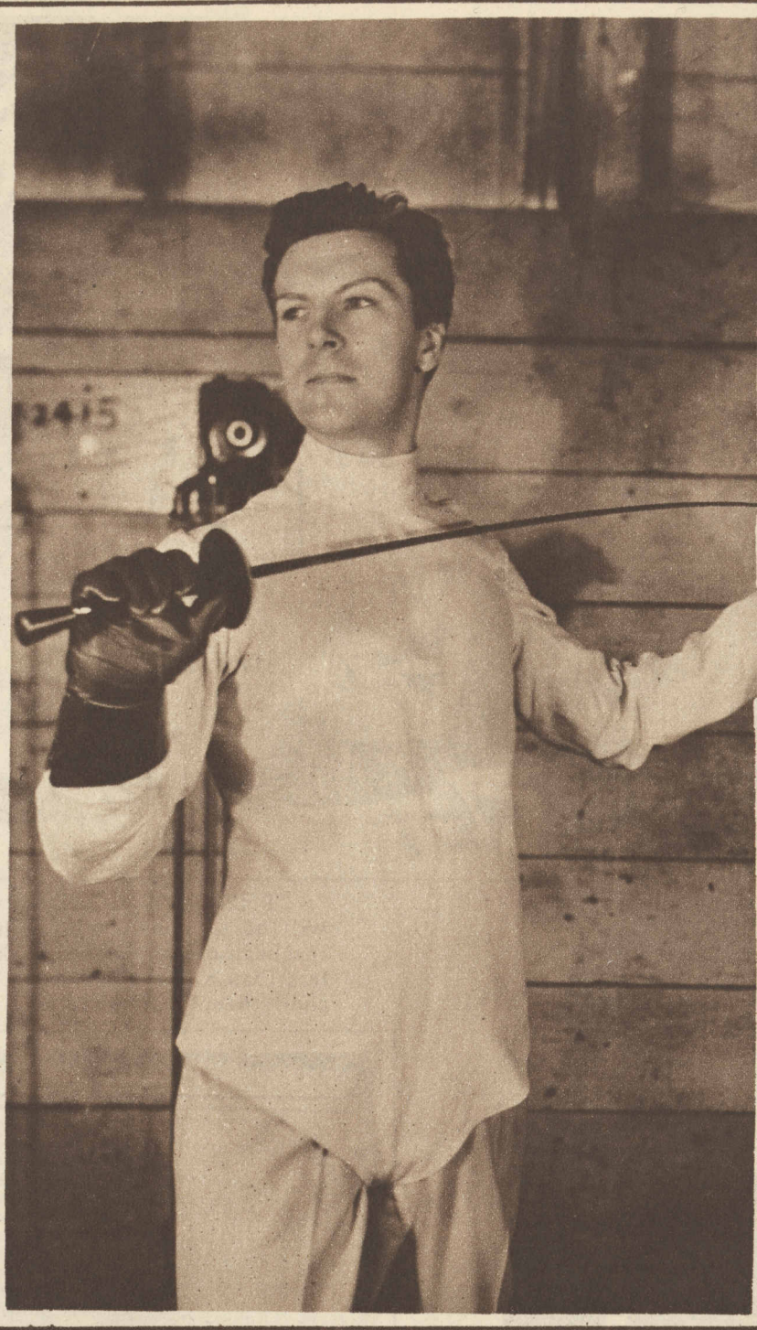
DENNIS KING, girls, for your scrapbooks! He is, as they say, a broth of a lad, and the chances are that the screen version of "The Vagabond King," in which he is working, will be a gratifying success.