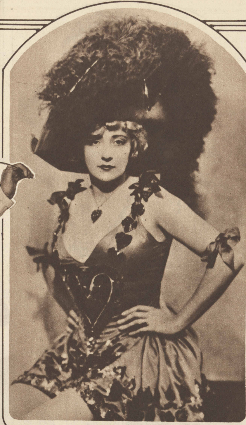
HELEN MORGAN, former night club queen, is seen here as Kitty Darling, which role she plays in "Applause."