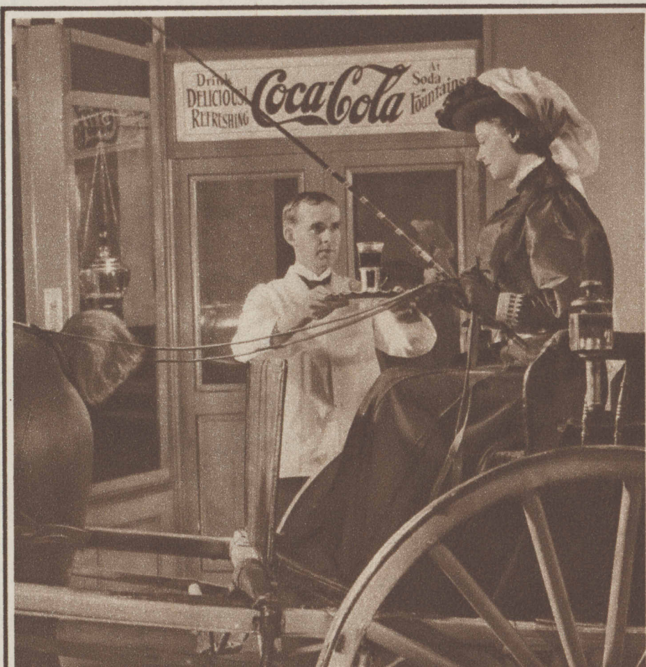
Ice-cold Coca-Cola first made a pause refreshing in 1886. Since then the soda fountain has become America's favorite place to pause.