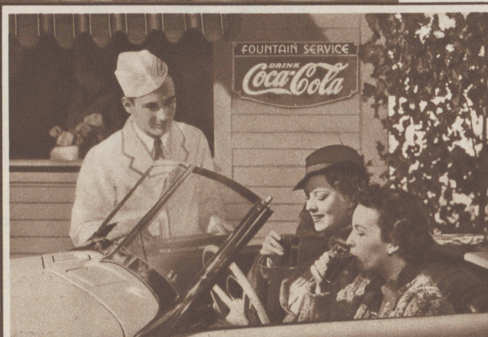
Where you go, thirst goes. On highways or by-ways, you find ice-cold Coca-Cola always near at hand to refresh you.