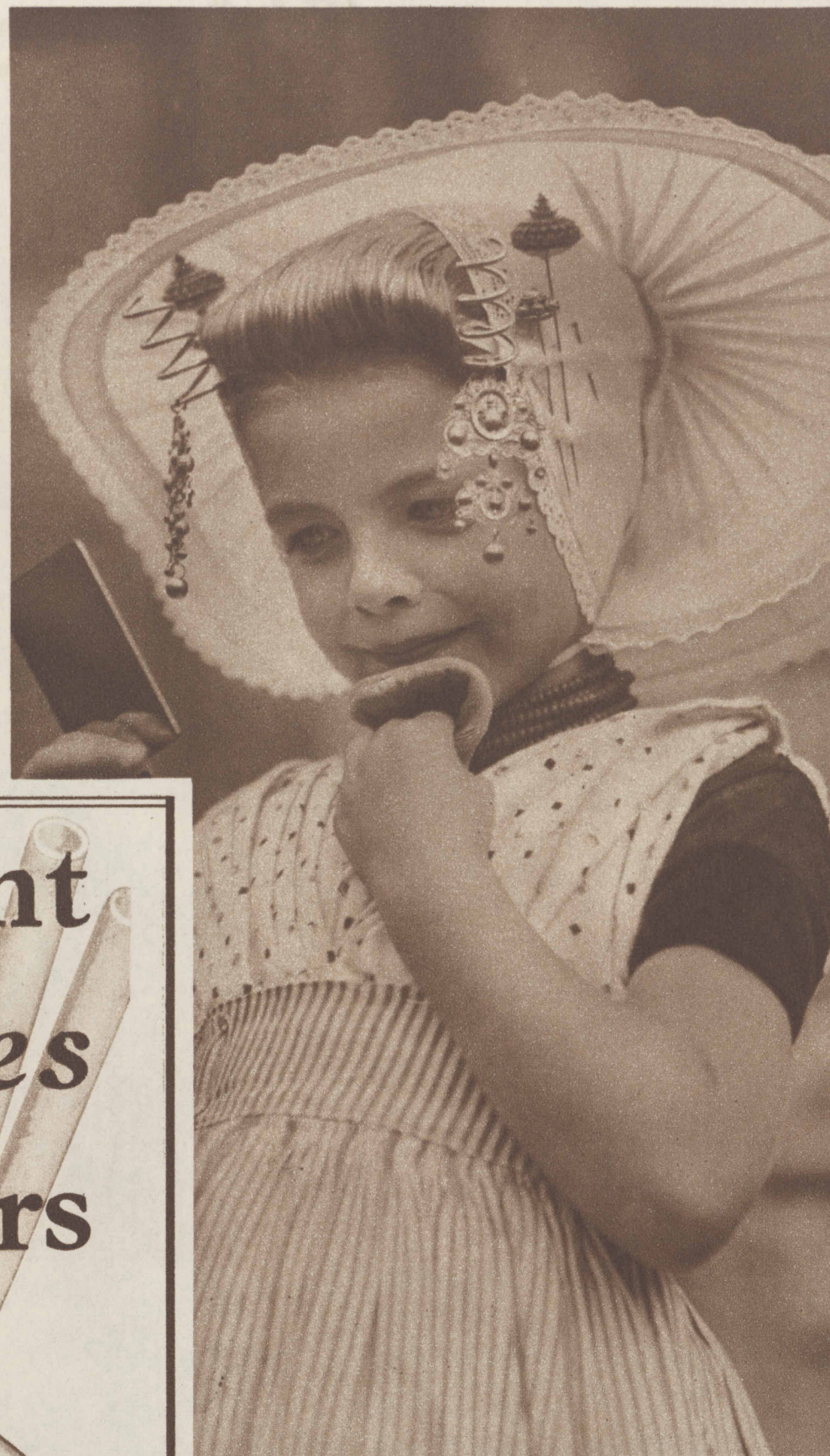
THE ETERNAL FEMININE—A Dutch maiden of Middleburgh puts borrowed mirror and powder puff to prescribed use.