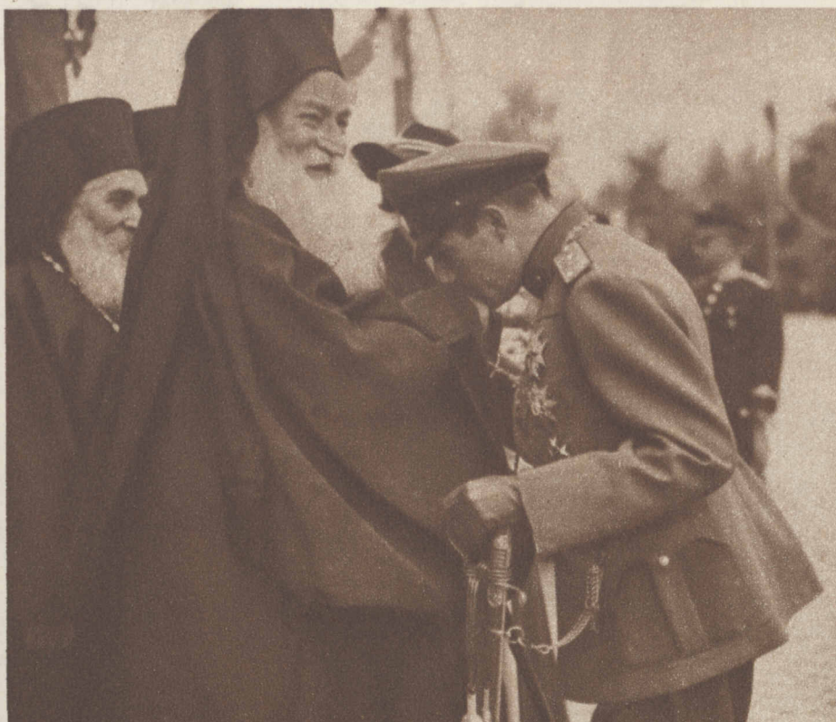
ROYAL OBEISANCE TO THE CHURCH—King Boris of Bulgaria kisses the hand of Bishop Maxime at ceremonies celebrating the anniversary of his accession to the throne.