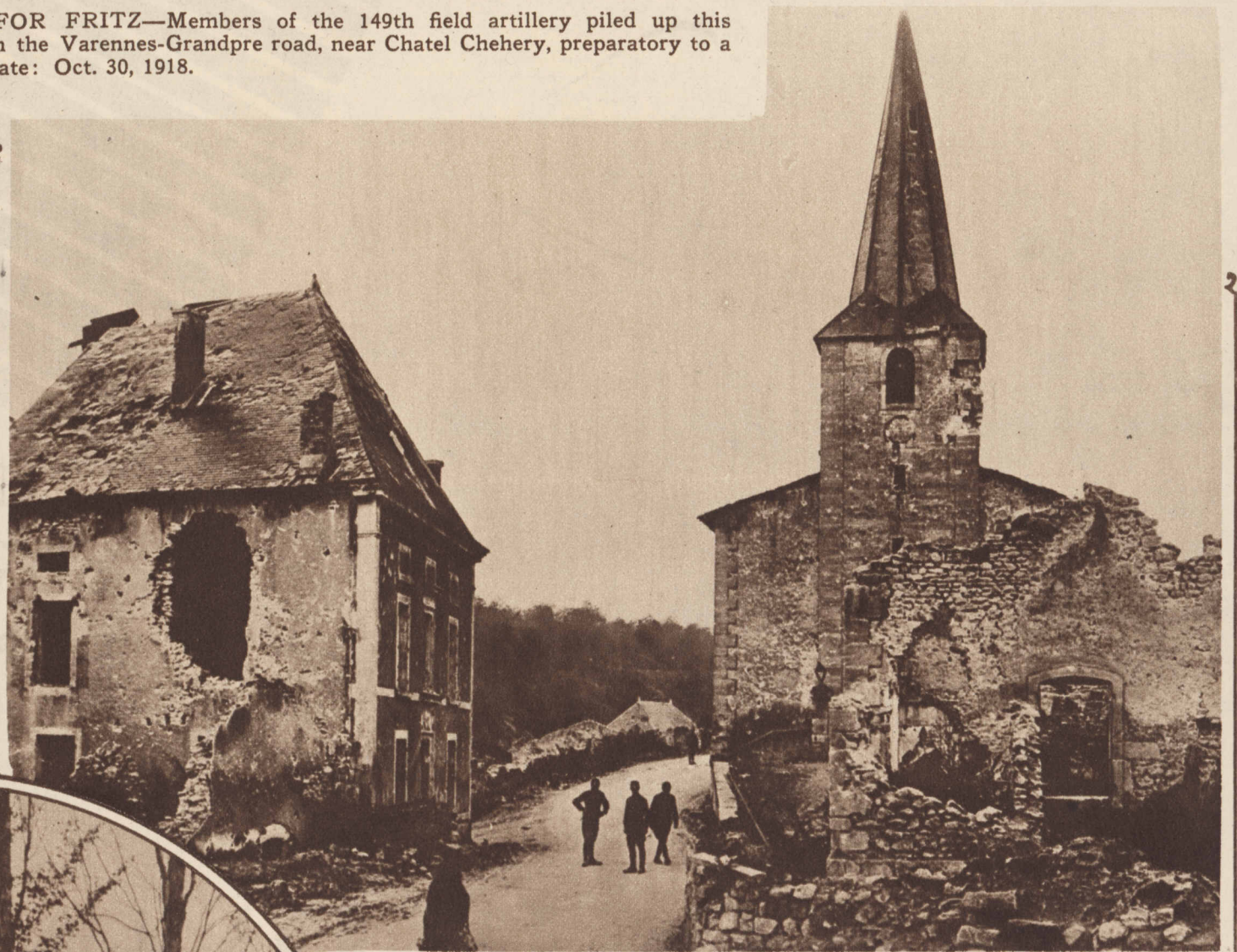
IN A WAR-WRECKED VILLAGE , Mouilly, where great, gaping wounds had been torn in the buildings, Illinois boys who made up the 108th military police were on duty Nov. 2, 1918.