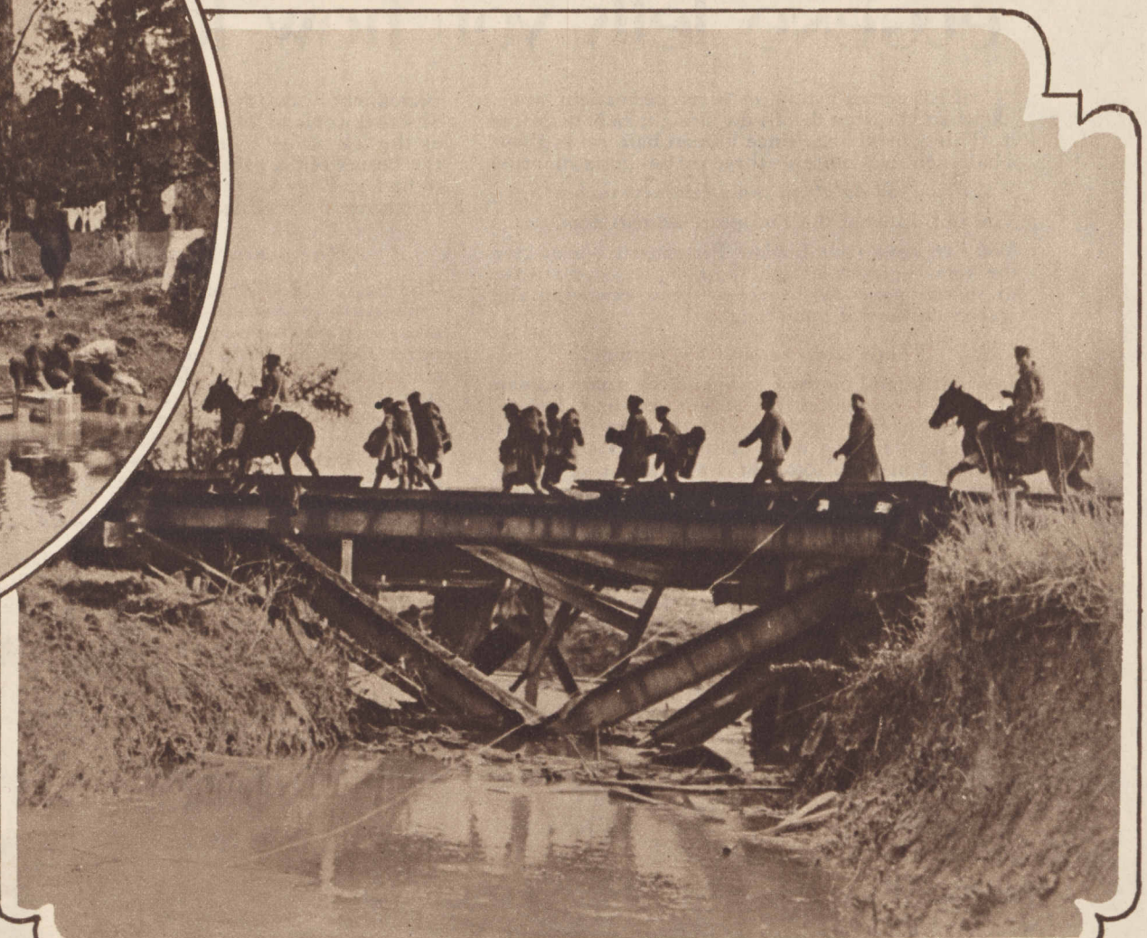
BLOWN UP , but not entirely blown away, by Yankee artillery, this railroad bridge near St. Juvén permitted men of the 42d division to cross over when they reached that point a decade ago next Saturday.