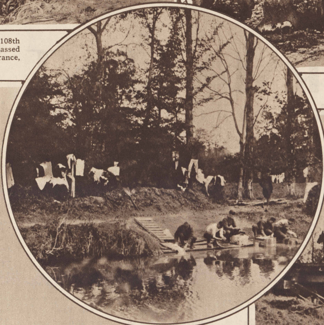
BLUE MONDAY —On the river Lisle, near Neuvic, Dordogne, dough-boys were engaged Nov. 1, 1918, in the unromantic but peaceful pastime of washing their clothes.