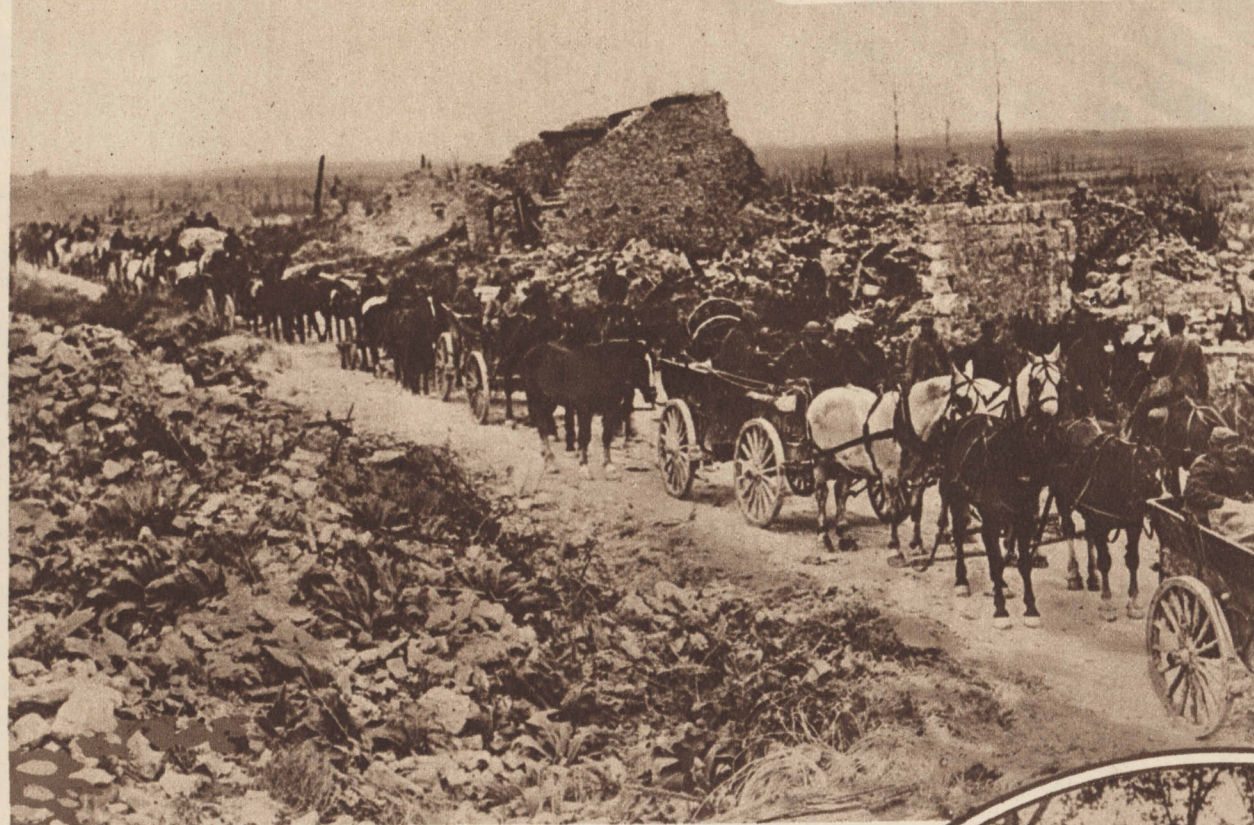
ILLINOIS MEN AMONG THE RUINS —The 108th engineers, once known as the 1st Illinois engineers, passed through what was left of Chattancourt, Meuse, France, ten years ago today.