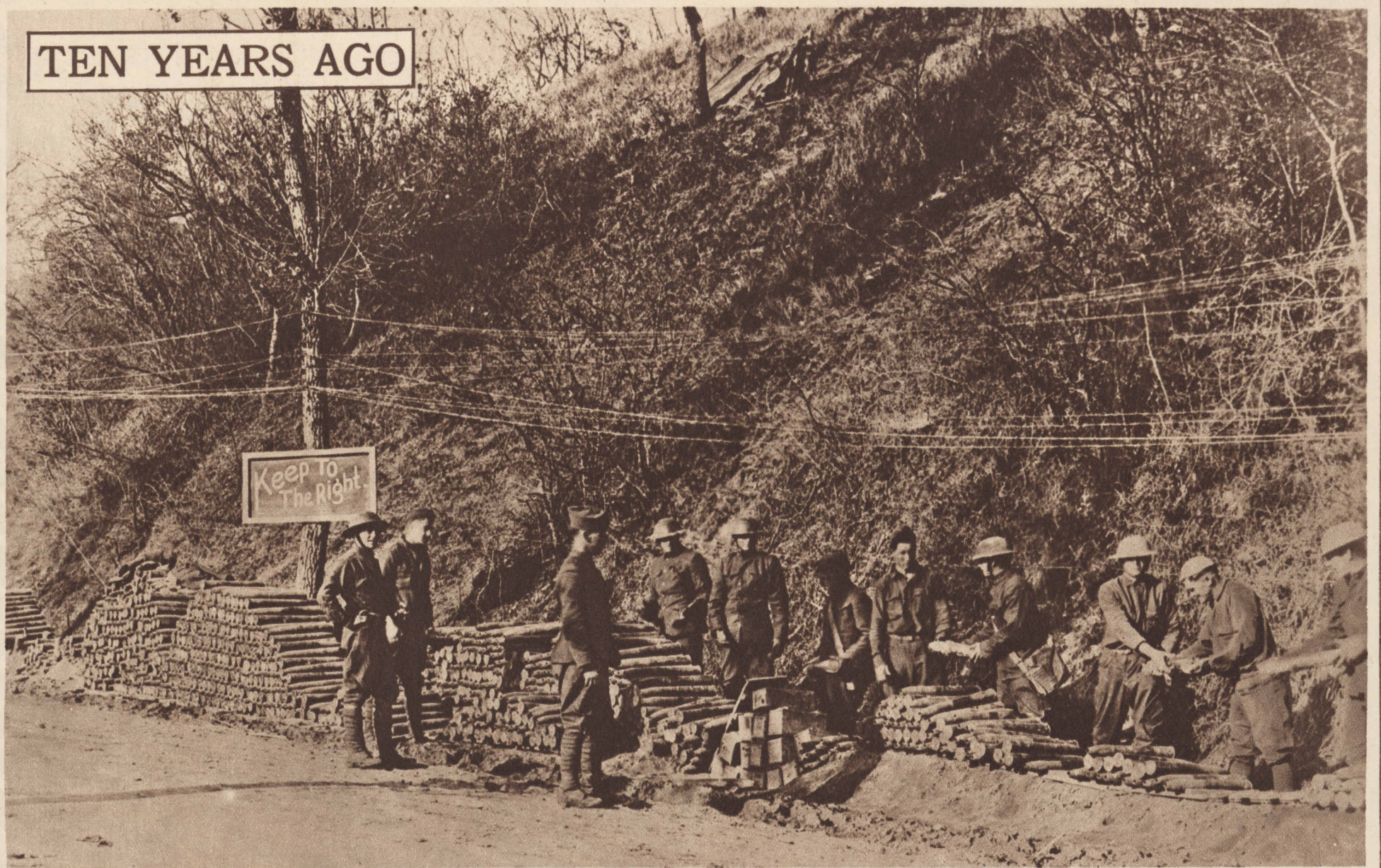
FORECASTING A STORM FOR FRITZ —Members of the 149th field artillery piled up this formidable array of 155-mm. shells on the Varennes-Grandpre road, near Chatel Chehery, preparatory to a bombardment of the German lines. Date: Oct. 30, 1918.