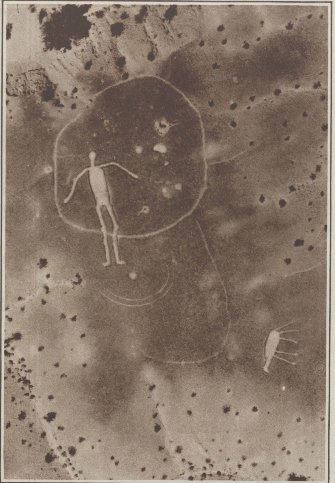
ANCIENT INDIAN "PICTOGRAPHS" DISCOVERED IN THE CALIFORNIA DESERT —An aviator, flying from Las Vegas, Nev., to Blythe, Cal., noticed these huge, crude images on the floor of the desert near the California town. Army aviators, assigned to investigate and photograph these examples of native art, found that the immense images of humans and beasts were produced by removing the brown pebbled earth and revealing the white alkali soil beneath. The human figure in the intaglio "pictograph" above is 167 feet long. That at the right, stepping out of a dance ring, is 95 feet long. In the picture at the left army and civilian investigators are seen measuring one of the huge figures.