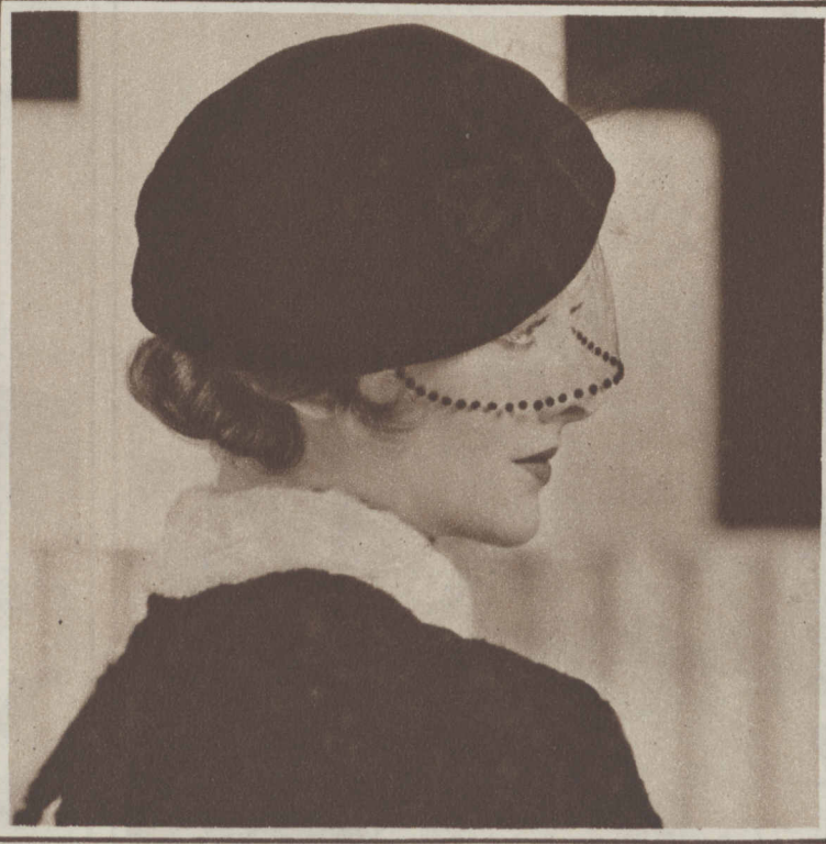
A BLACK VELVET BERET HAT , with bow trim of black malines and malines veil with chenille dots, is worn by Myrna Loy.