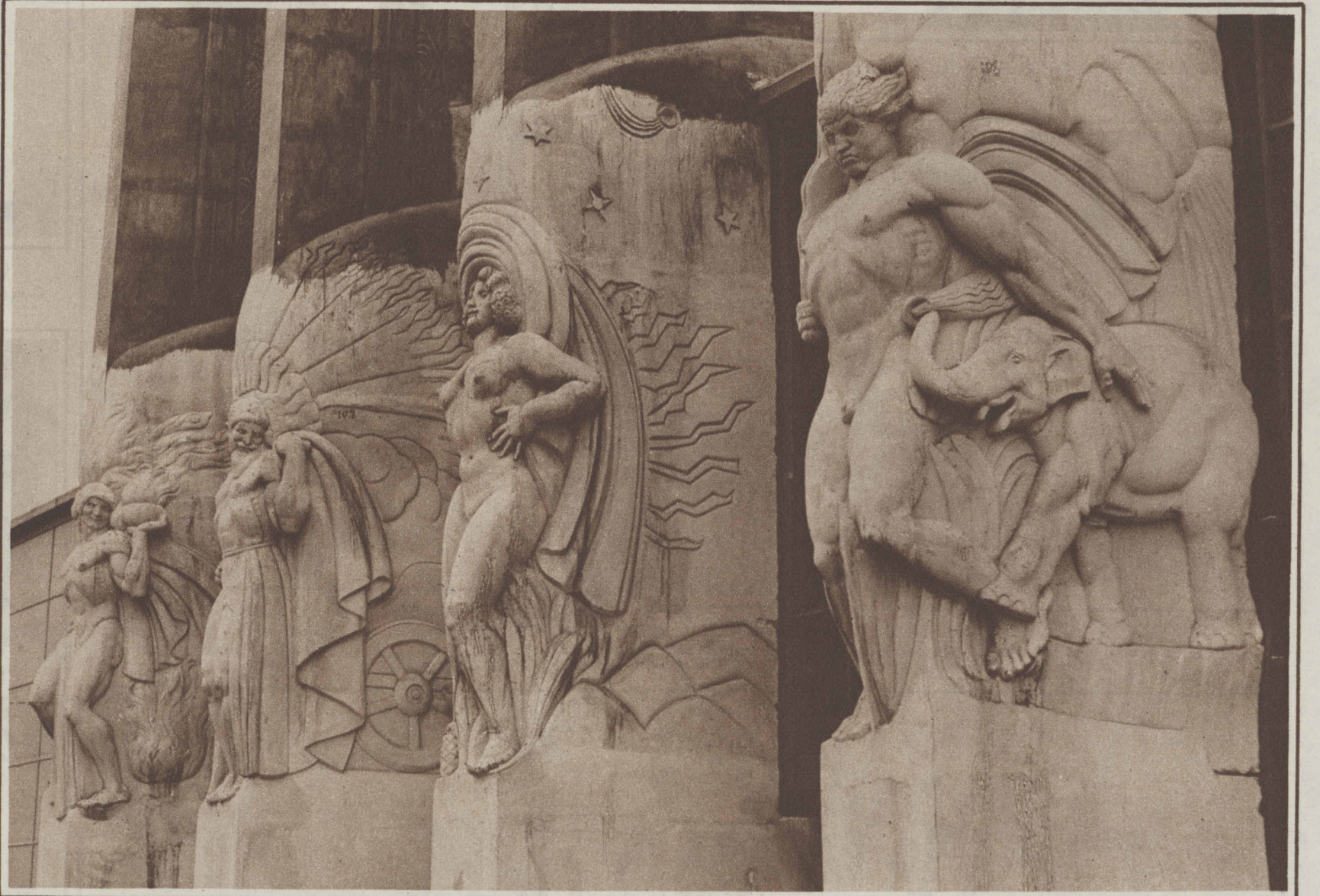
CARYATIDS AND SCULPTURED MALE FIGURES ornament the recently dedicated Electrical group of the Century of Progress Exposition on Chicago's lake front.