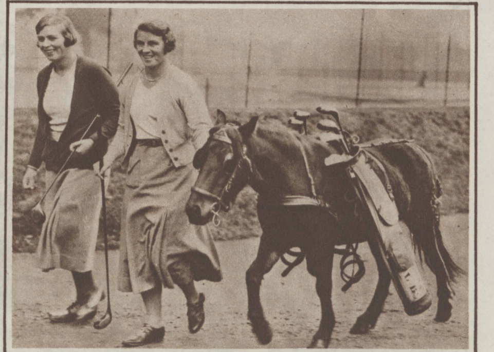
A CADDIE WHO WILL NOT SNEER AT DUBBED SHOTS accompanies these two fair golfers on the links at Ranelagh, England.