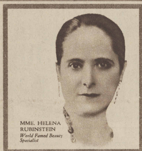
MME. HELENA RUBINSTEIN World Famed Beauty Specialist