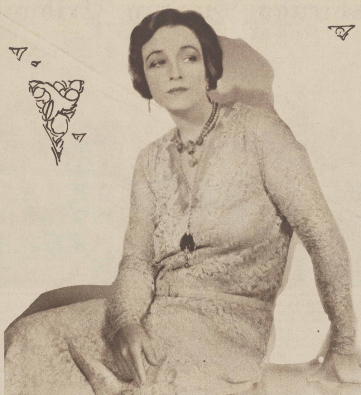
PAULINE FREDERICK has not retired from the screen, as you may have thought because of her long absence. No, she's been working hard on two all-talkers that will be seen in the near future. They are titled "Evidence," and "The Sacred Flame."