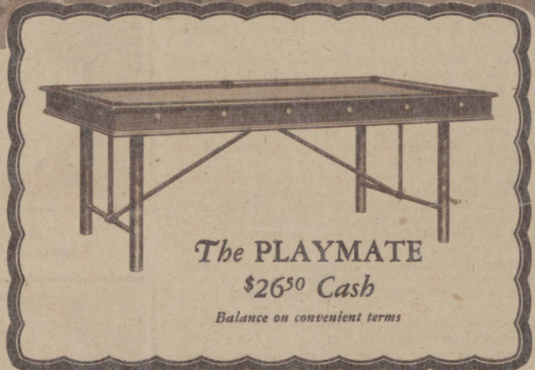
The PLAYMATE $2650 Cash Balance on convenient terms

And now the new Brunswick Home Billiard Tables have brought this fascinating sport within the means of the most modest purse. Mail the coupon for full descriptions, prices and easy terms. The Brunswick-Balke-Collender Co., Est. 1845. Branches in All Principal Cities of U. S. and Canada.