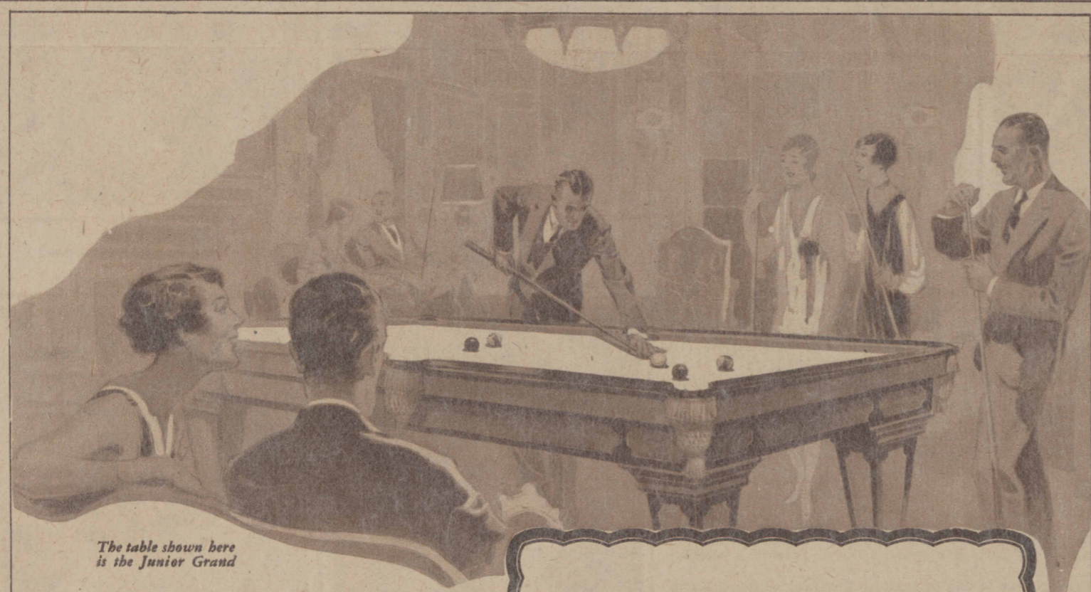
The table shown here is the Junior Grand

THE NEXT GOVERNOR OF NEW YORK IS HERE—If you like, you may exercise your political sagacity by picking the winner from the pair. Democracy has picked on Gov. Al Smith, at the left, in the hope of sending him to Albany for still another term; and his Republican opponent is Rep. Ogden L. Mills, at the right.