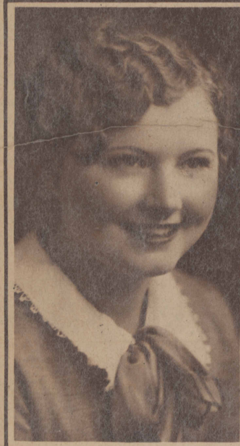
MISS S— Boone, Ia.—Home Girl