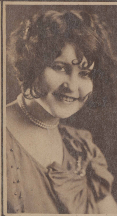
MISS W— Elkhart, Ind.—Factory Girl