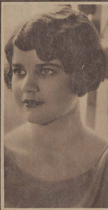
MISS M— Magnolia Ave., Chicago—Home Girl