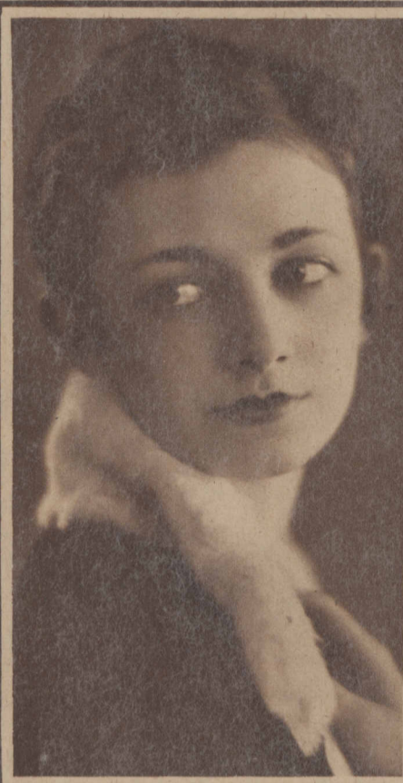
MISS S— Washington Blvd., Chicago— Home Girl