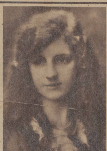
MISS V— Park Ridge, Ill.—School Girl