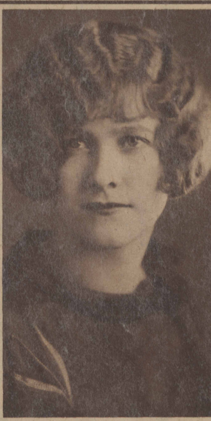
MISS A— Janesville, Wis.—Factory Girl