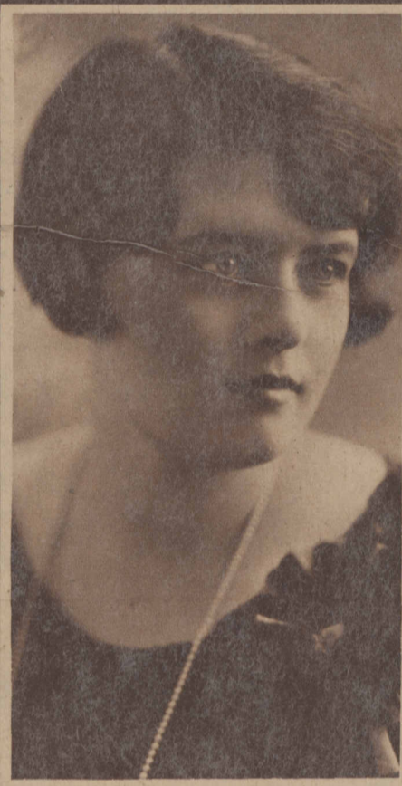
MISS S— Cairo, Ill.—School Girl