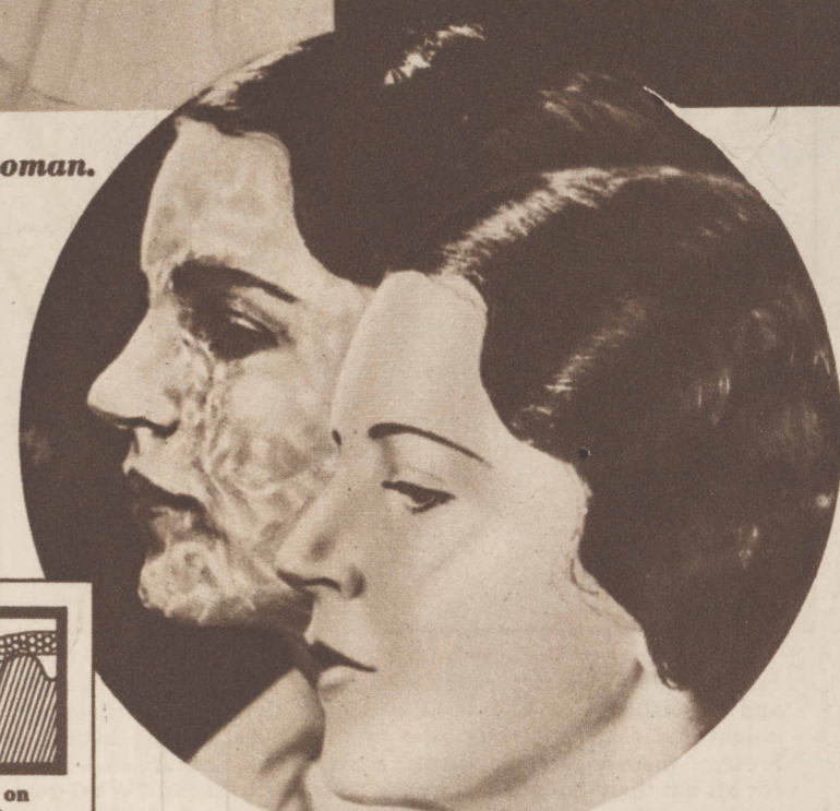
Notice to Women

On right, Hinds Cleansing Cream. Melts at once. Gently penetrates pores, removes dirt, dust, make-up. No rubbing needed.