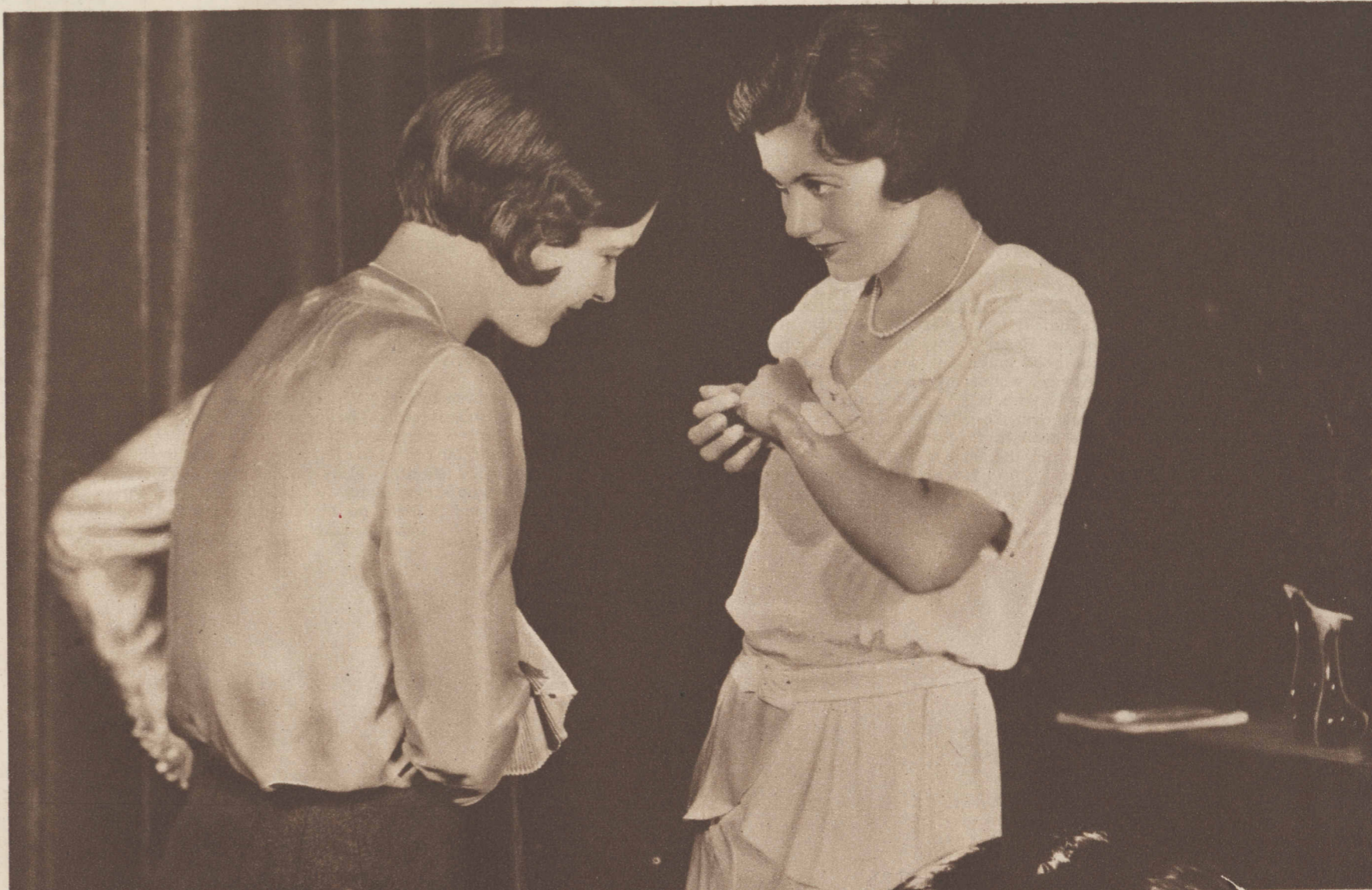
SHE SEES DIFFERENCE! Simple comparison convinces woman.

Does it not seem utter folly to continue with old-type cleansing creams that merely skim surface of skin when first applied? That require vigorous massaging to penetrate?