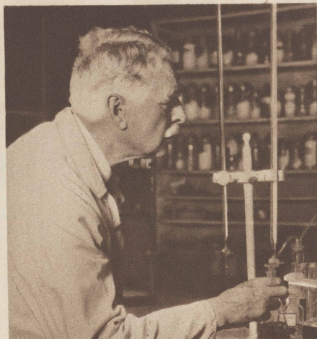
Scientists worked three years to perfect this new cleansing cream formula.

Note contrast in old-type cleansing creams that go on skin like lard and new cream that melts at once, cleansing skin of dust, dirt, make-up.