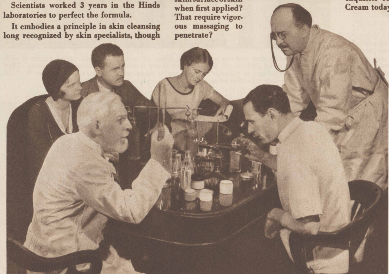
DRAMATIC TEST made at New York laboratory proves three new Hinds products equal in quality to products of the expensive lines bearing famous "individual" names and selling at prices from two to eight times more than they do.

Made by makers of Hinds Honey and Almond Cream