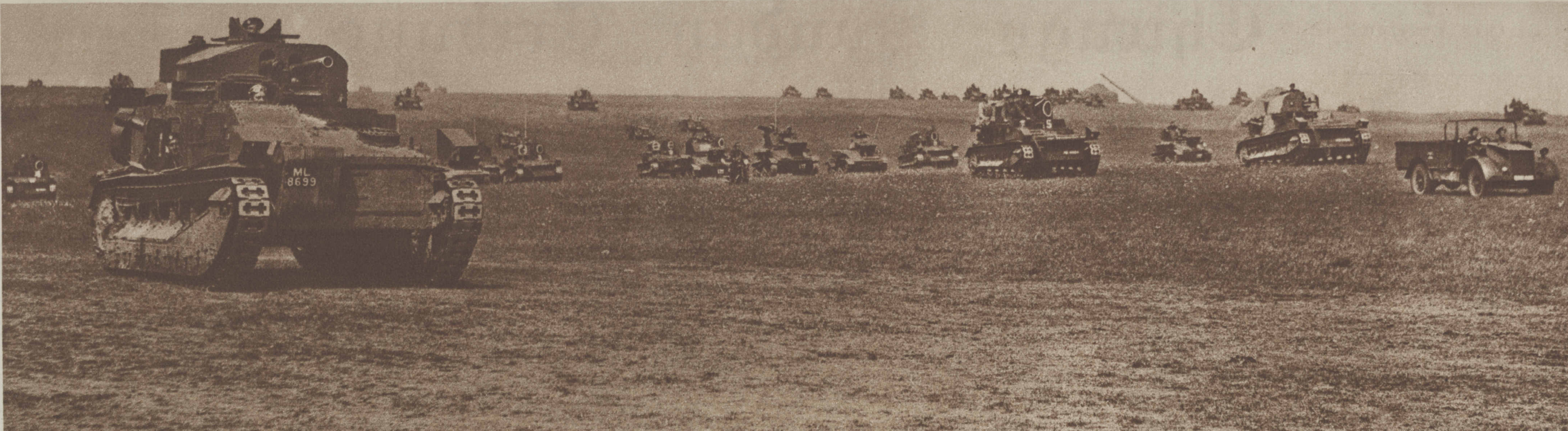
WAR REHERSAL IN ENGLAND—Land dreadnaughts maneuvering on Salisbury plain.