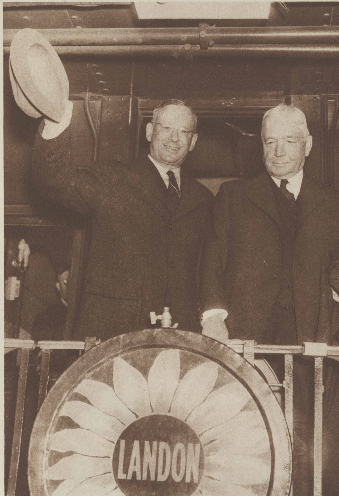
LOWDEN JOINS LANDON ON THE CAMPAIGN FRONT—The former governor of Illinois (at right) with the Republican candidate for president aboard the latter's special train.

Leading Radio Dealers and Department Stores