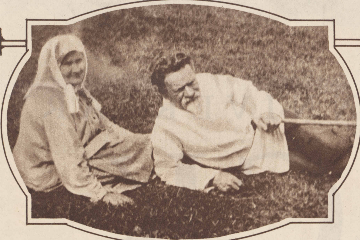
THE PRESIDENT IN HIS OLD HOME TOWN—Michael Kalinin, head of the central executive committee of the Soviet union, knocks off work and for a few hours of respite joins the back-to-the-farm movement. The camera found him with his mother at his native village, Verkhaya Troiza.