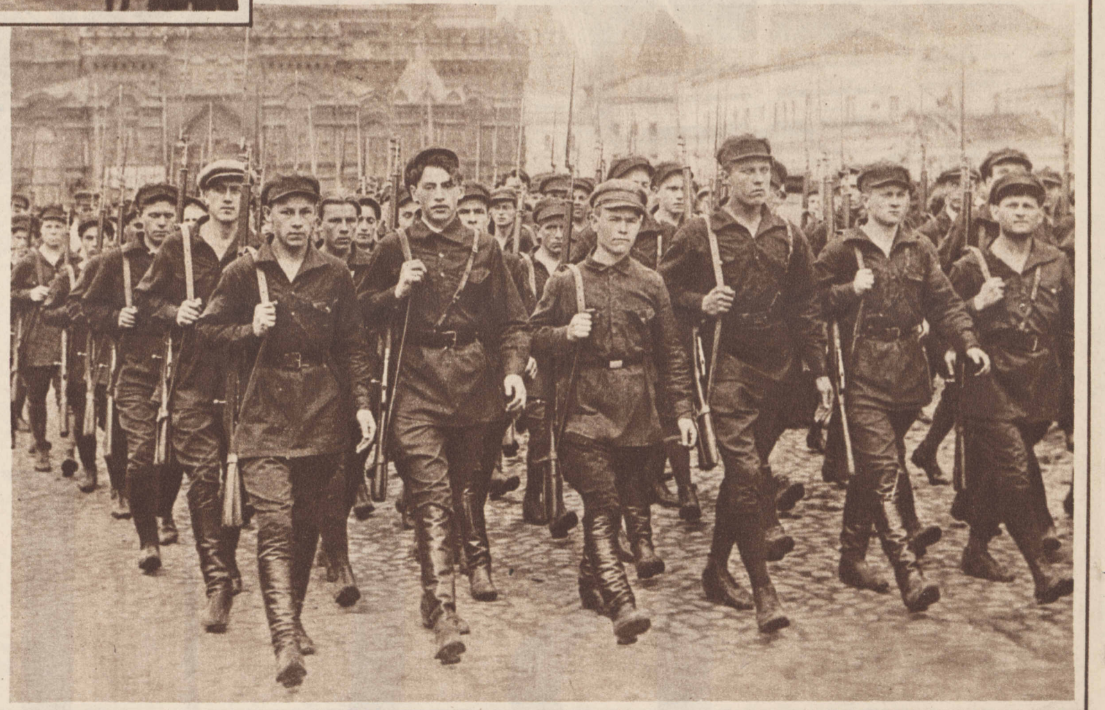
A FIELD OF BOYS AND BAYONETS—More than 150,000 young Soviets stormed Red square, Moscow, recently to celebrate International Youth day. How a column of them, doing their "squads east" on the square, looked to the bystander is depicted here.