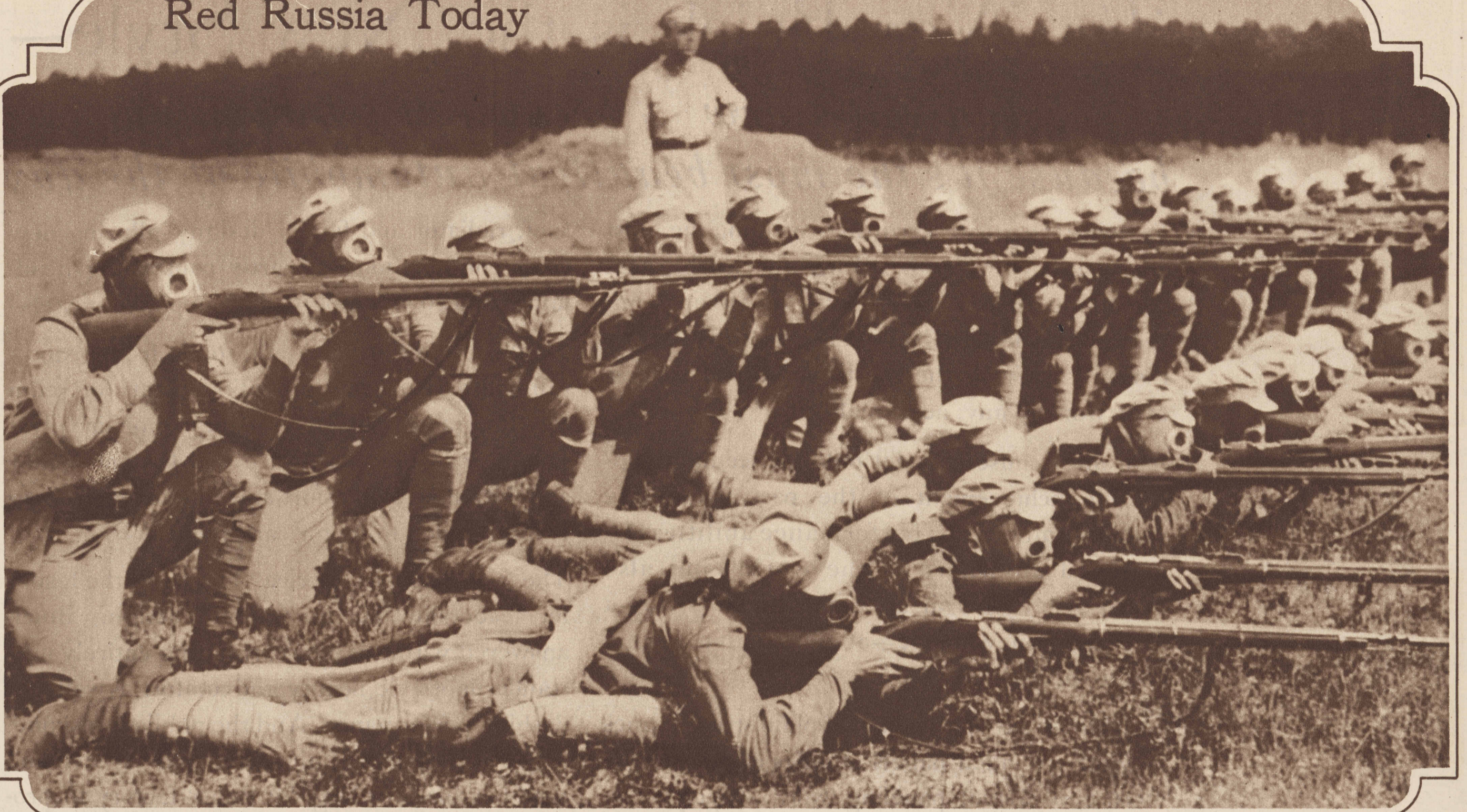
THE RED ARMY prepares for eventualities. And "the bear which walks like a man," as Kipling once described him, wears a gas mask as he acquires a deadly aim in the open. The field maneuvers pictured here took place near Moscow.