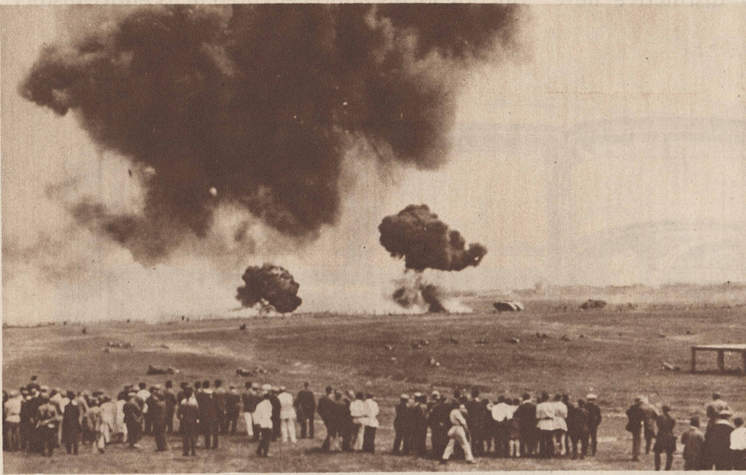
SOUNDS OF WAR echoed throughout all Moscow during the army maneuvers. For the edification of the delegates to the sixth "Komintern" congress in that historic city, a sham battle was staged in the nearby countryside.