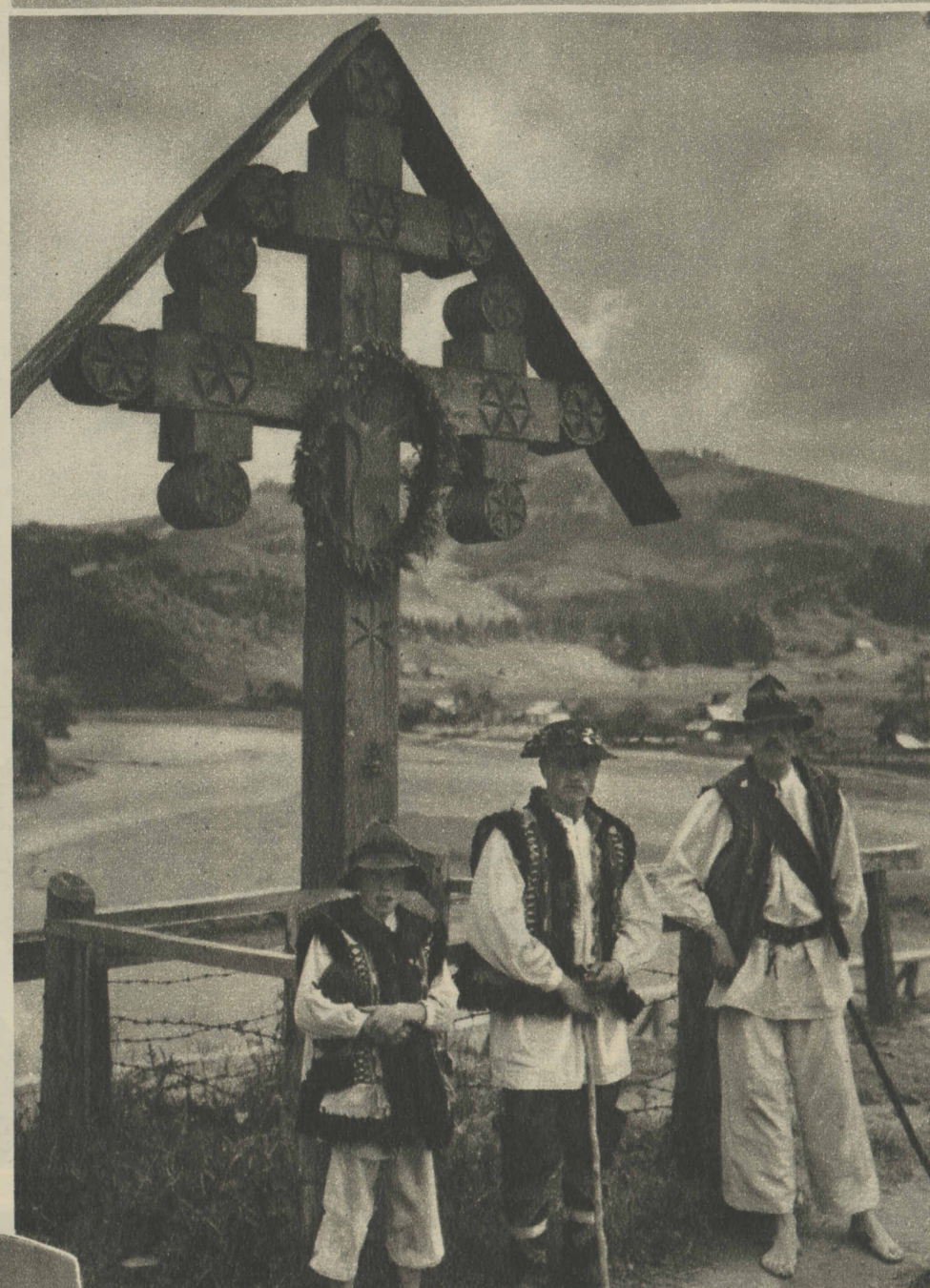
2 Religion has a strong hold on Poland. The picturesque mountain countryside is dotted with shrines such as this. These men are Hucules, mountaineers of the eastern Carpathians.