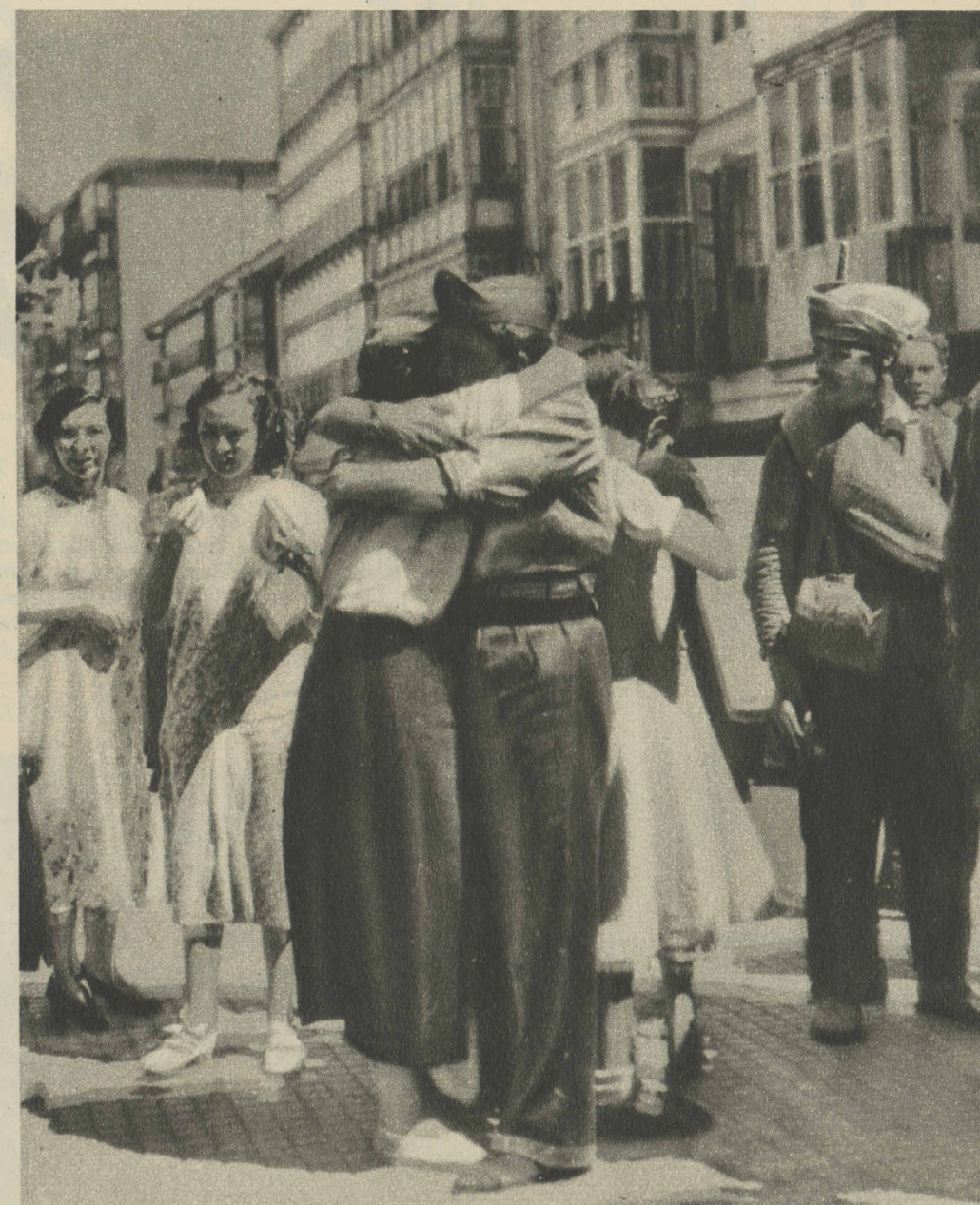
1 Separated for months by his participation in the rebel war against Spain under General Franco, this former resident of Santander is embraced by his daughter when his troop finally re-enters the town.