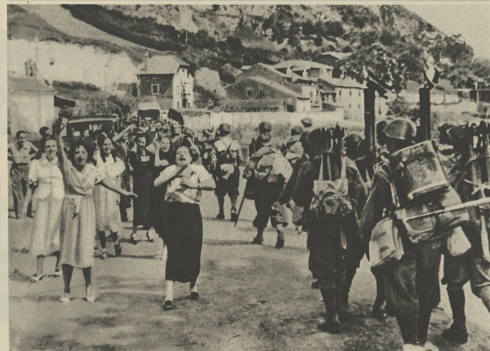
2 Women greet the rebel troops as they march into the strategically important northern town after a long siege had driven out the loyalist army. Most of the men had been drafted by either defending or attacking forces.