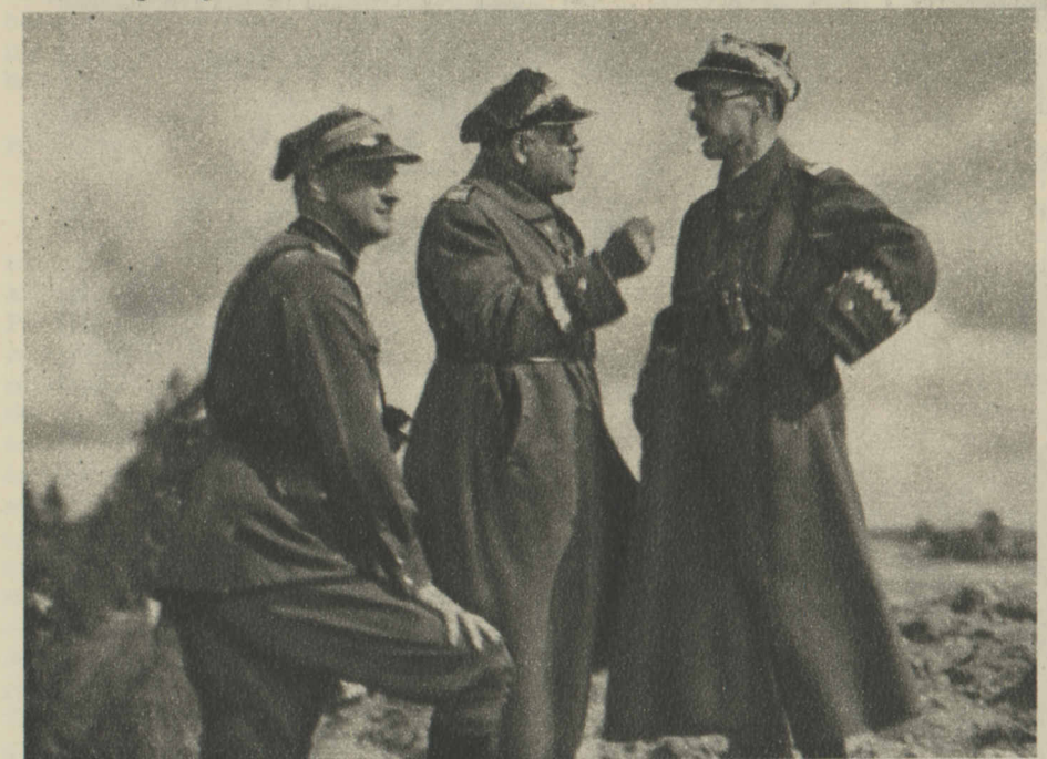
4 Supervising army maneuvers to strengthen the country's defenses, Gen. W. Stachewicz drives home a point in conversation with fellow officers on the field.