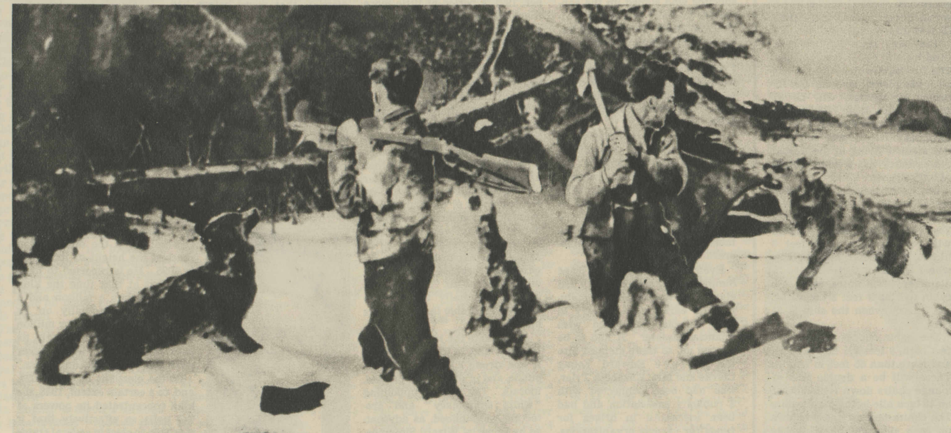
4 Attacked by a band of hungry timber wolves near Sudbury, Ont., Canada, two hunters, their ammunition exhausted, use rifle and ax to halt the pack. The picture was submitted by a third member of the party who said he snapped it as he arrived on the scene and just before he routed the wolves after shooting three of them.