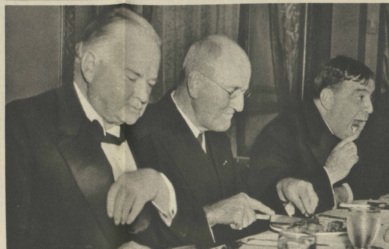
3 Former President Herbert Hoover, James G. Harbord, chairman of the board of R. C. A., and Mayor Fiorello La Guardia of New York pay no heed to the candid camera while giving full attention to food at an American Legion banquet.