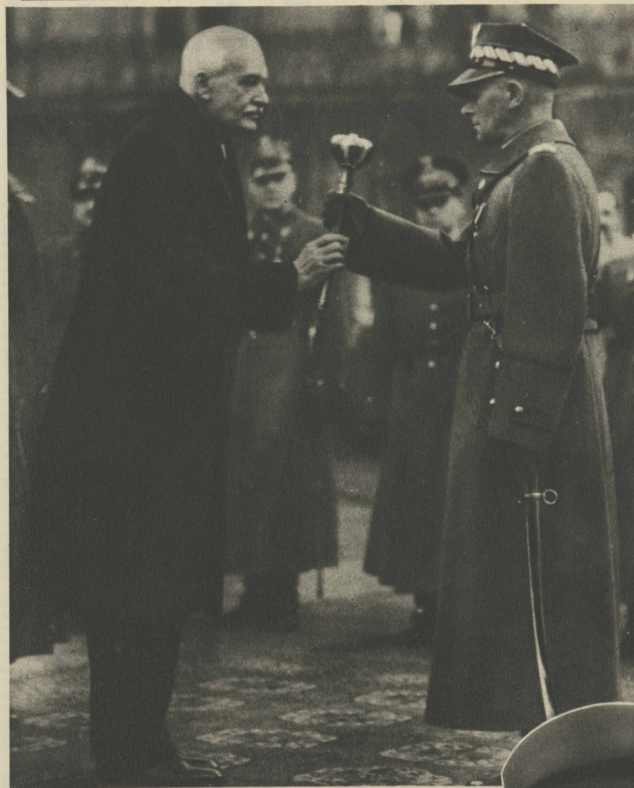
1 Poland, the post-war corridor between Germany and Russia, is stirring again with internal troubles. Facing Nazism, communism, socialism, the nation finds itself ruled by a military bloc headed by Marshal Edward Rydz-Smigly, former general and successor to the late Marshal Pilsudski. Rydz-Smigly receives his emblem of office from President Ignacy Moscicki, nominal but nearly powerless leader of the nation.