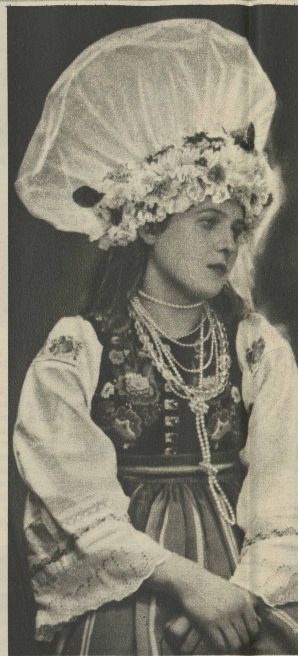
3 Poland is noted for beautiful women. This girl, a recent bride, poses for the first time in the costume of a married woman.