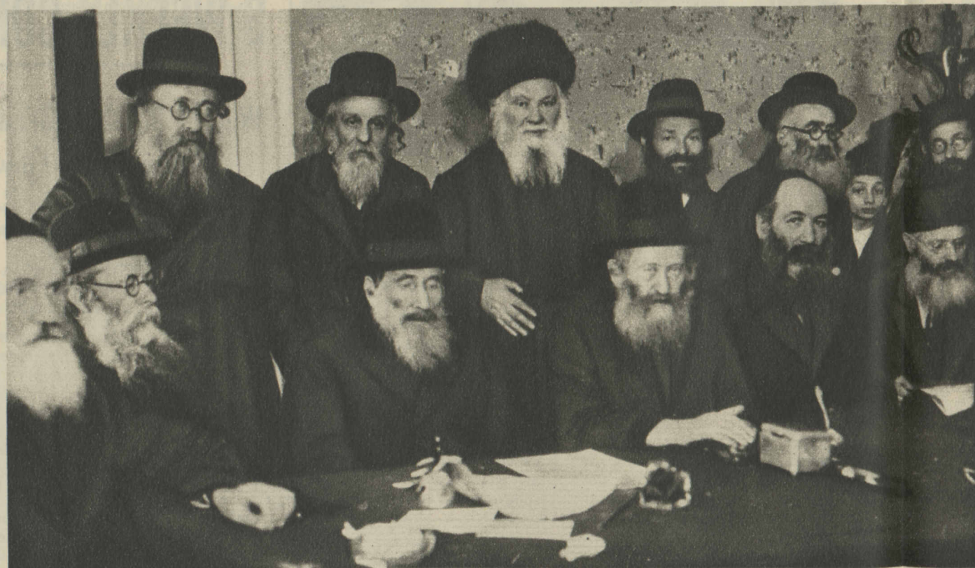
6 Rabbis and miracle workers convene at Warsaw to protest nationalistic movements outlawing the Jewish race. Parliamentary bans on the ritual slaughter of animals, except for consumption, were the first wedge in a drive that has now been climaxed by prohibition of some 4,000,000 Jews from membership in the National Unity party, newly formed by the Rydz-Smigly regime. Race riots have kept the nation stirred for months.