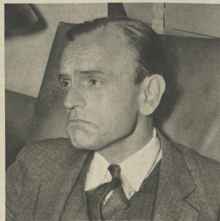
2 Off guard for a moment, James M. Landis assumes this none too jubilant expression as he discusses with reporters his resignation as chairman of the Securities Exchange commission. He is the new dean of Harvard's law school.