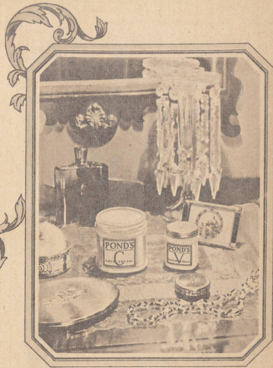
AN EARLY AMERICAN DRESSING TABLE TO MISS ANNE MORGAN'S TASTE

loves contrast. Her dressing table reflects the gleam of crystal, the brilliance of gold, the cool radiance of silver. This pair of gold-lined silver jars, embossed with Her Majesty's crest and richly chased, contains her favorite creams—Pond's Cold Cream to cleanse and Pond's Vanishing Cream to give a transparently lovely finish to Her Majesty's well-nigh perfect skin!