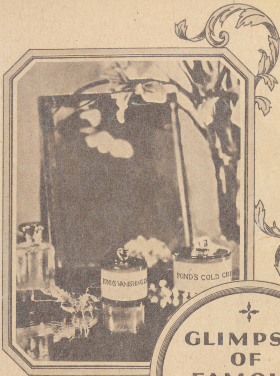
LADY LOUIS MOUNTBATTEN'S SHERATON DRESSING TABLE

is characteristic of the restrained taste of the true aristocrat. This beautiful young gentlewoman, one of England's greatest heiresses and a member of the British Royal Family, has chosen a dressing-table of Sheraton design with a mirror mounted in black leather. Its polished surface tosses back the gleam from gold topped perfume bottles and from the cloudy amber of her toilet set. Slender teakwood lamps and a tall vase of purple iris flank the mirror. A pair of jade green glass jars adds a dash of bright color. These jars, which hold Lady Louis's favorite creams, for guarding the extraordinary beauty of her skin, were presented to her by the Pond's Extract Company.