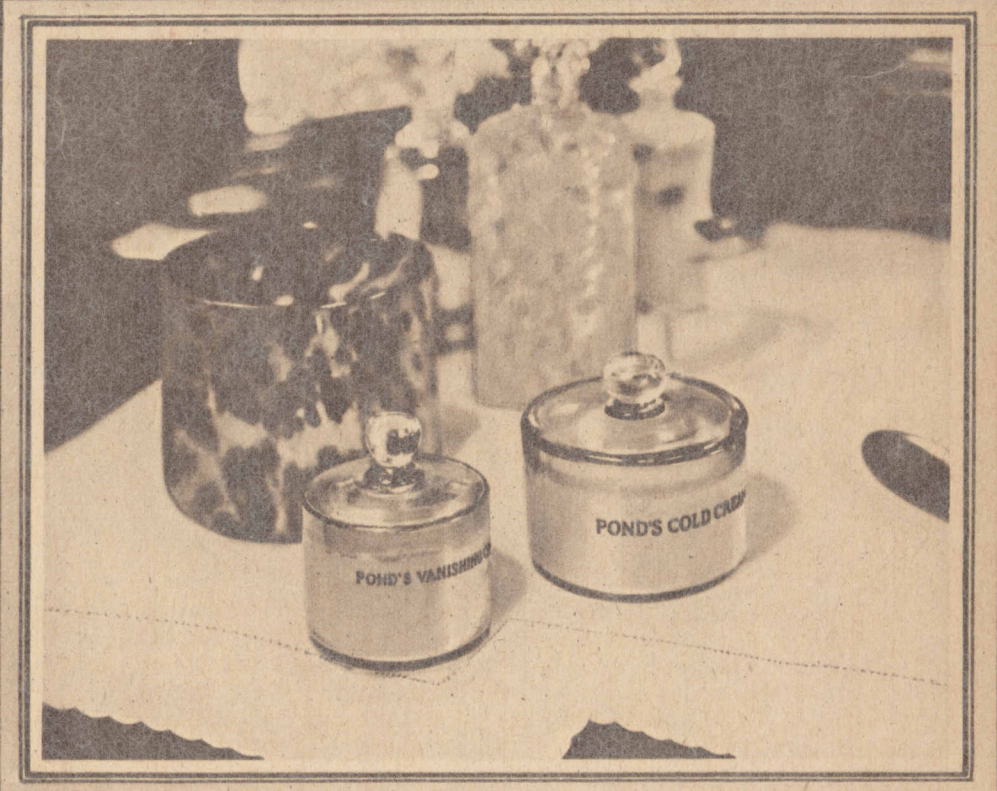
THE DRESSING TABLE OF "MARGOT," THE COUNTESS OF OXFORD AND ASQUITH

The delightful little dressing-room for her guests, in her enchanting house in New York's exclusive Sutton Place, is furnished with rare antiques. On a tiny, historic Louis Seize poudreuse, old Chinese porcelain jars offer a fragrant greeting of pink roses; twin glass jars containing Pond's Cold and Vanishing Creams offer hospitality to guests; while antique painted powder boxes tempt their last minute vanity. These accessories—old and new—complete an exquisite ensemble for giving one's toilette the last perfecting touch before one dines with Mrs. Vanderbilt, New York's most distinguished hostess.