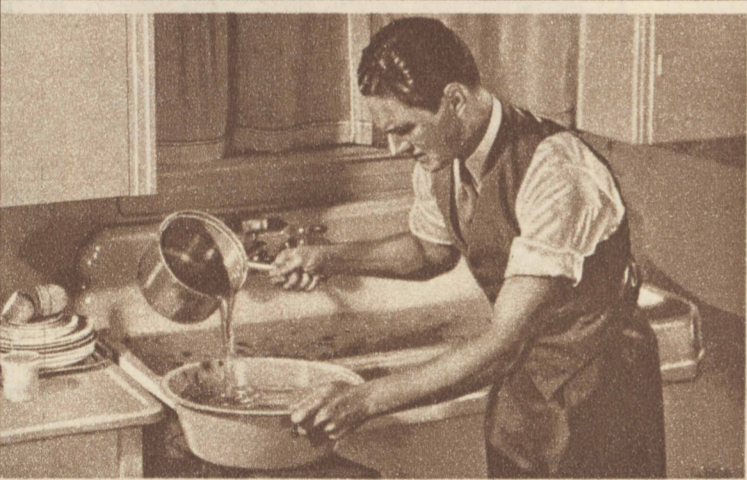
"HERE'S A PICTURE OF ME as a one-man bucket brigade! The kitchen drain was clogged and I was bailing out the sink so I could go to work with a wire and plunger. But right below is . . .