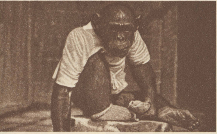
"A PICTURE OF THE MONKEY my neighbor made of me—by cleaning that clogged drain with a little Drano! That Drano is great stuff—you just pour it down the drain and it gets down deep and actually digs out the clogged part. And from now on, I know how to keep the drain clear, fast-flowing—with Drano! Put a teaspoonful of Drano down the drain each night—when the dishes are done!"

Drano USE DRANO DAILY TO KEEP DRAINS CLEAN NEVER OVER 25¢ AT GROCERY, DRUG HARDWARE, STORES