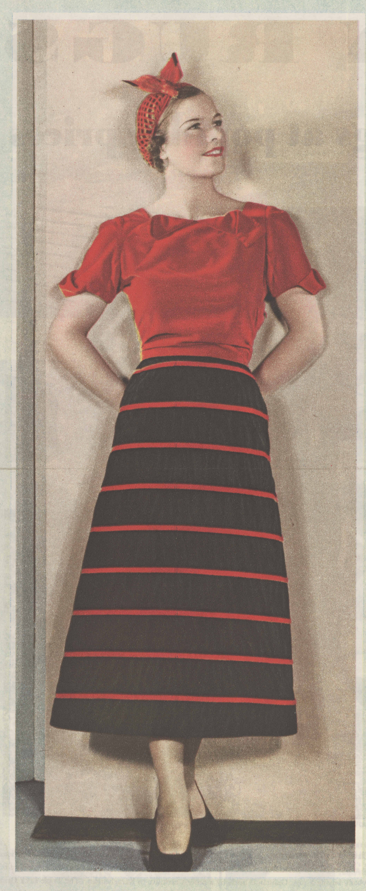
THE NEWEST WAY TO LOOK IN THE EVENING - From the clever young designer, Schiaparelli, who is making short taffeta skirts like this and striping them with bright velvet. The bodice is of red velvet, and the snood of red chenille, with a bird poised aloft.