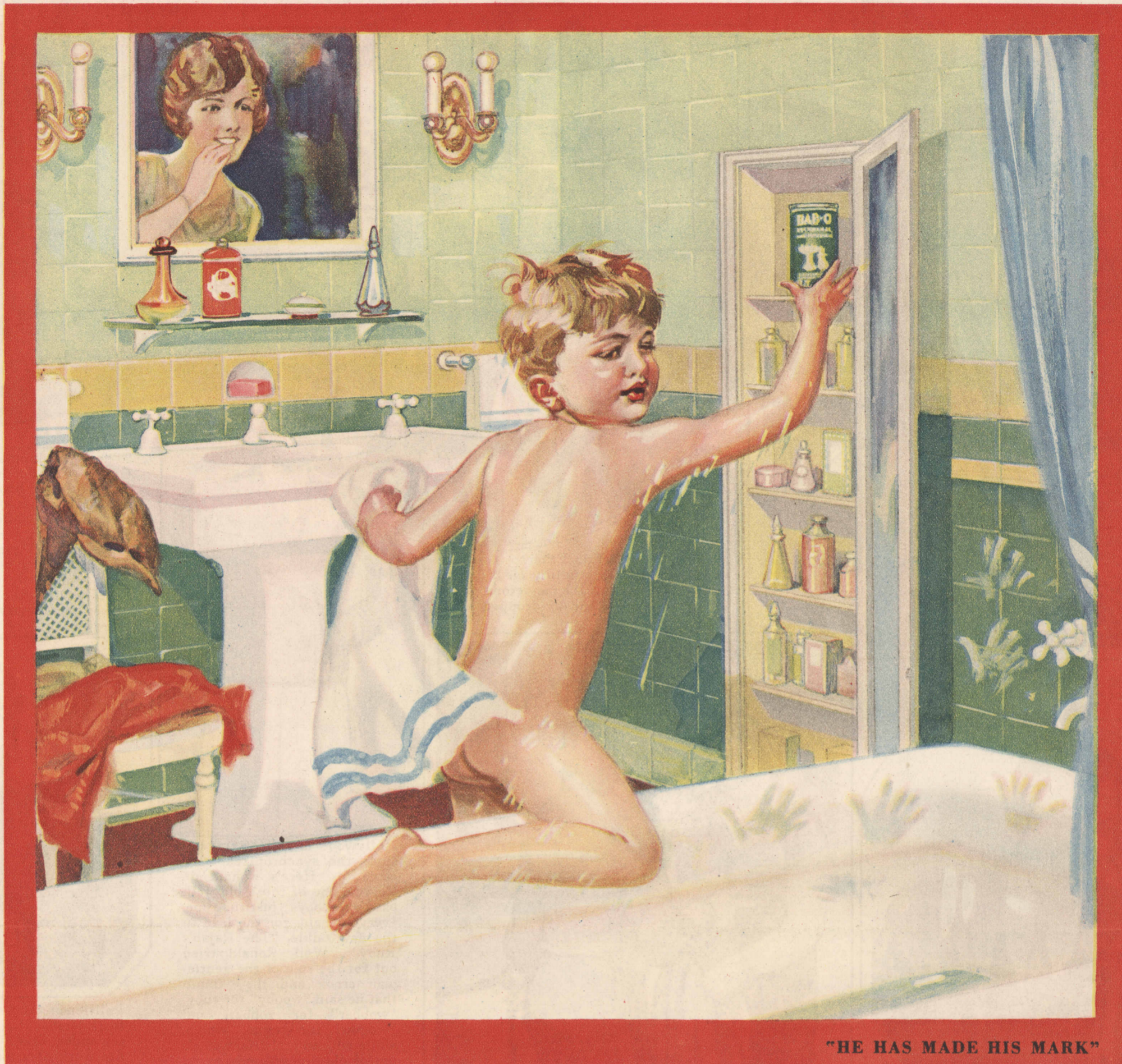
"HE HAS MADE HIS MARK"