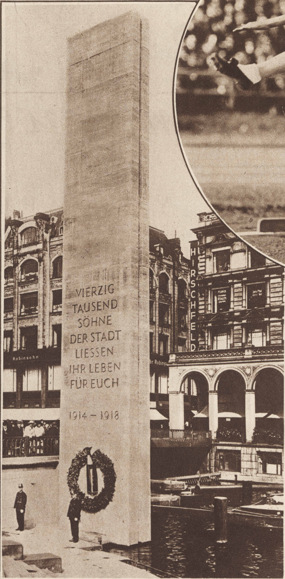
GERMAN WAR MEMORIAL—The center of the Hamburg arcades at Hamburg harbor is the site of this shaft erected to the memory of the seaport's 40,000 war dead.