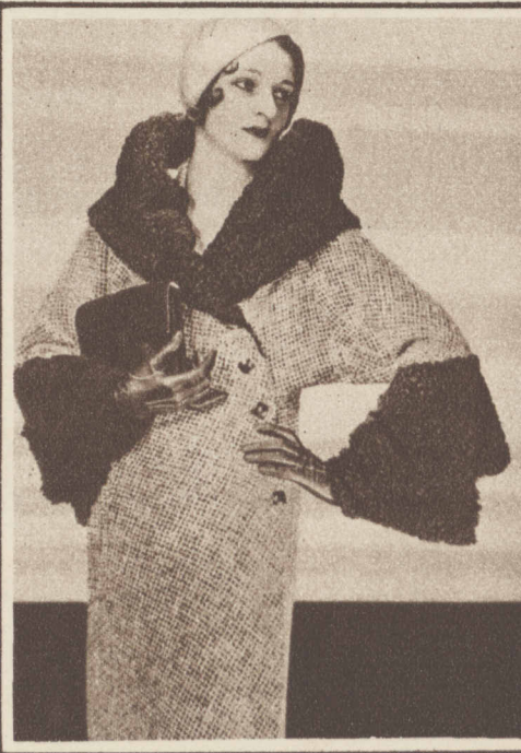
THE BROKEN BLACK AND WHITE CHECK DESIGN of this morning coat is set off by black astrakhan collar and cuffs.