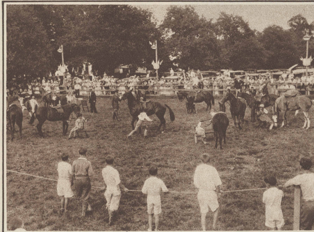
MUSICAL CHAIRS RACE—The climax of the Newport, R. I., children's gymkhana was furnished by this game, in which the moment the band stops playing the youthful equestrians dismount and dash for chairs.