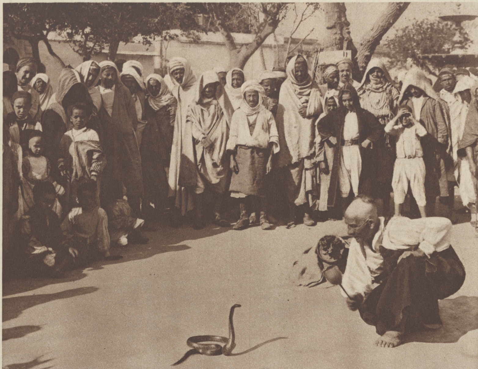
SNAKE CHARMER OF TUNISIA.