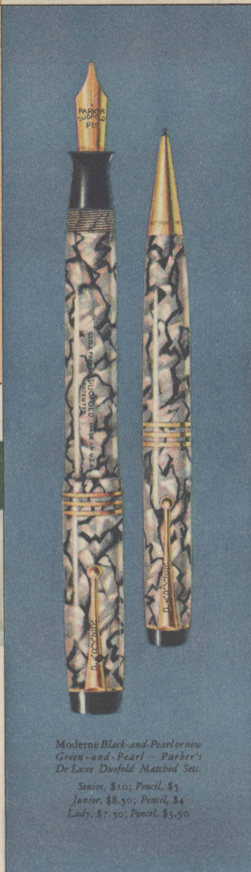
Moderne Black-and-Pearl or new Green-and-Pearl—Parker's De Luxe Duofold Matched Sets. Senior, $10; Pencil, $5. Junior, $8.50; Pencil, $4. Lady, $7.50; Pencil, $3.50.

Every Parker Duofold is convertible—a combination pocket and desk Pen both, at no extra charge.