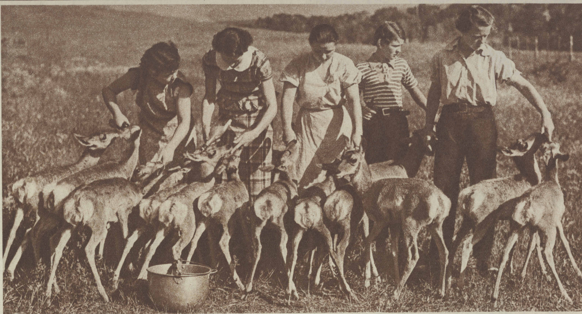
BOTTLE BABIES—An- telope fawns being raised on a Wyoming ranch.

National Air Conditioning, Inc., 101 Park Avenue, New York City Please send me, without obligation, name of nearest dealer and information on National Oil Heating Units Room Cooler Home Air Conditioner Name _____ Address _____ City _____ State _____