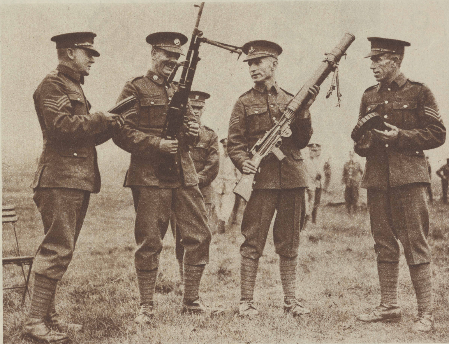
ENGLAND TESTS A NEW WEAPON—Brit- ish soldiers comparing the new Bren machine gun (left), being tried out in field maneuvers, with the Lewis.