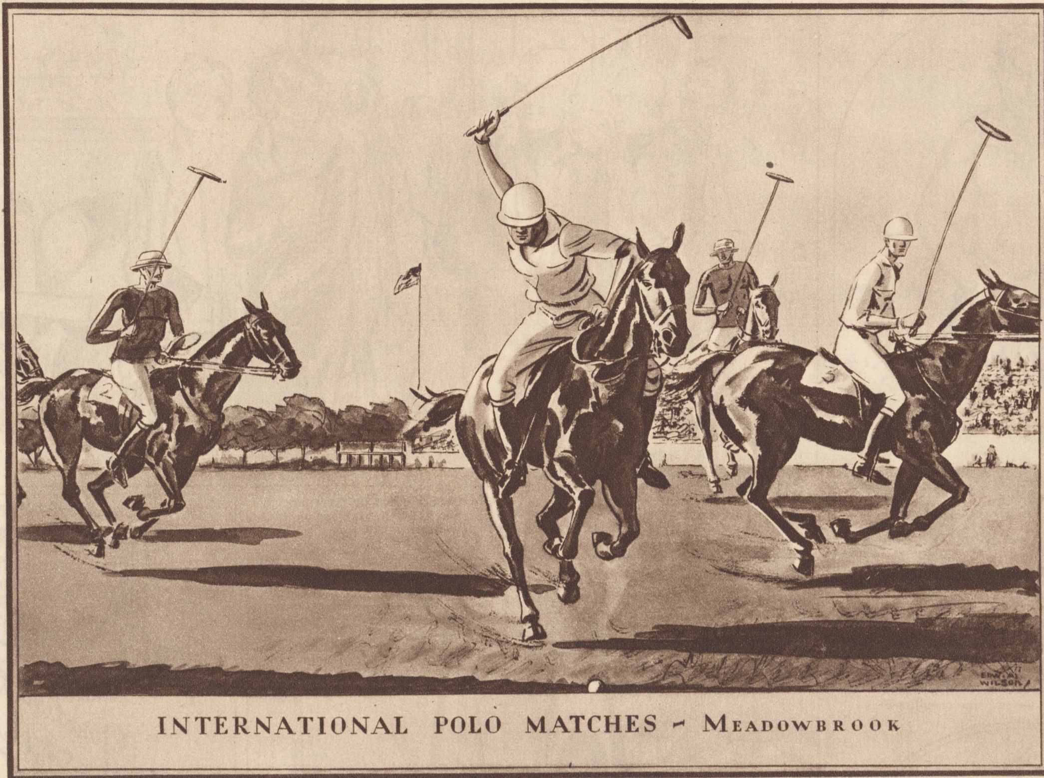
INTERNATIONAL POLO MATCHES - MEADOWBROOK

☞ Last year, the International Cup Matches were played between the British Four and America's Four. "The big matches" went to the Americans by scores of 13 to 3 and 8 to 5.