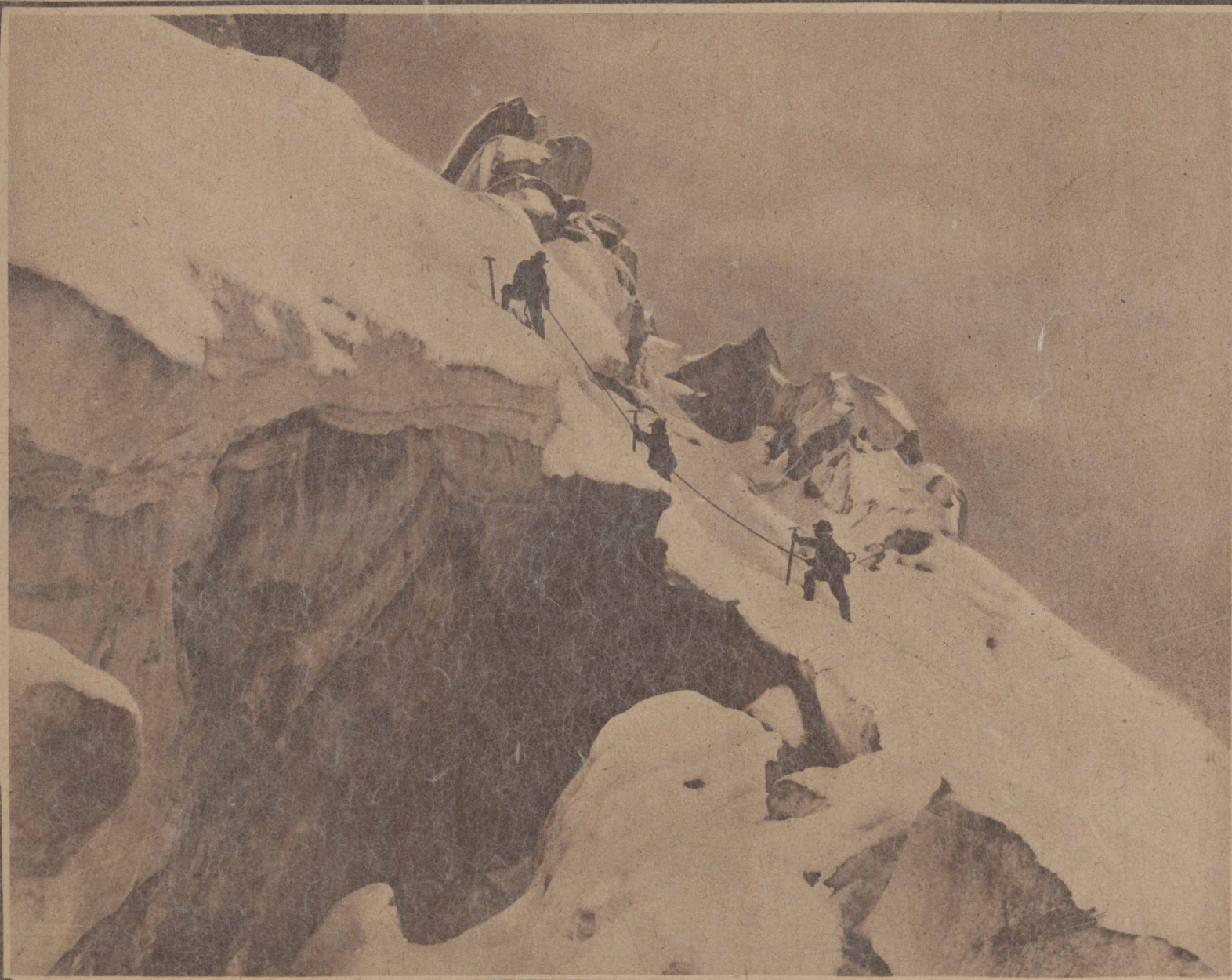
DARING DEATH ON MONT BLANC, Europe's loftiest mountain peak, which towers 15,700 feet. Scores of lives have been lost in the grand crevasse, pictured at the right. It is a declivity in the glacier at the foot of the peak. The scene at the left shows a party of climbers crossing the Bridge of Snow at the Grand Mulets, the half-way point in the two-day climb to the peak.