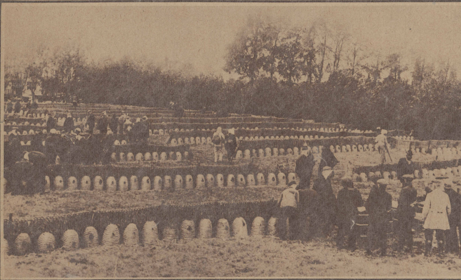
FIVE BILLION BEES are being sold or traded this year in the village of Veenendaal in Holland, which has the only public bee market in the world. From all sections of the country the bee farmers arrive, carrying their hives with their thousands upon thousands of bees. The market is held once each year.