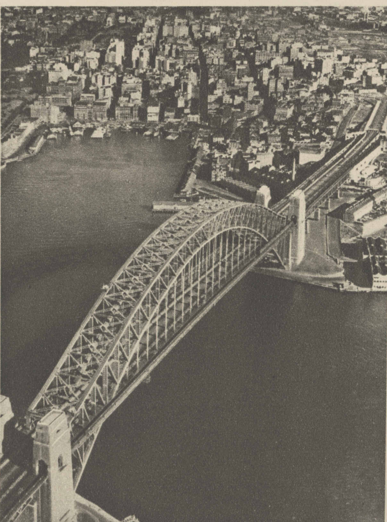
The famous bridge that is a landmark in Sydney harbor, Australia.

Newfoundland was made a self- them, such as Sarawak, possess governing dominion with membership in the British imperial conference but without membership in the league of nations. By 1933 it had drifted into such a desperate financial state that it became necessary to revert its position to that of a colony until such time as it again should become self-supporting. By the ous degrees of internal auton-Newfoundland act, passed Dec. parliament and a government 21, 1933, by the British parlia-