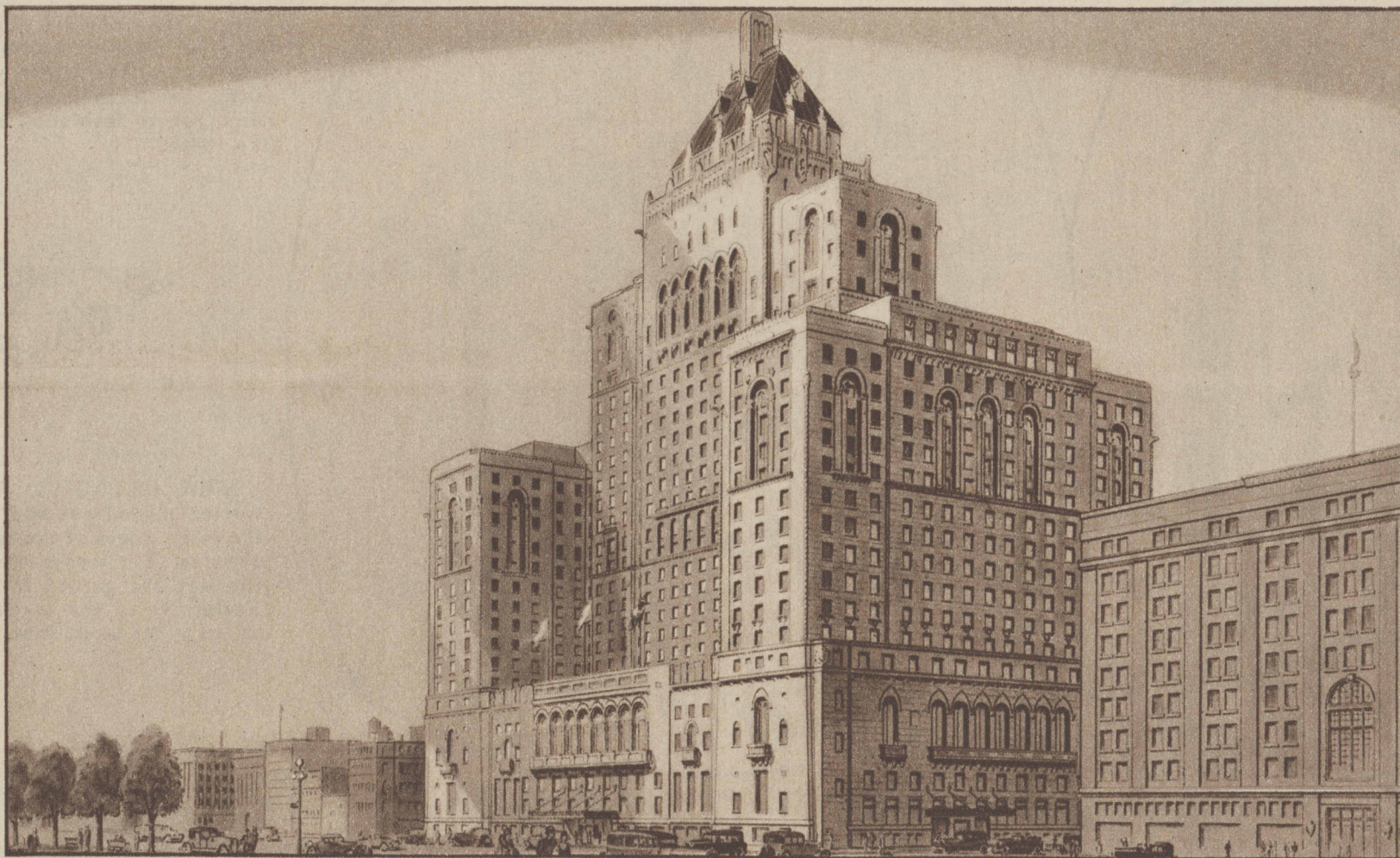
"WESTWARD THE COURSE OF EMPIRE"

TORONTO—"the meeting place." The Royal York—a truly regal place of entertainment. "Canada Dry"—the beverage which world travelers find here as they would find in any great city . . . in the Houses of Parliament at Ottawa . . . at great hotels in New York . . . in London . . . at many cafes in Paris.