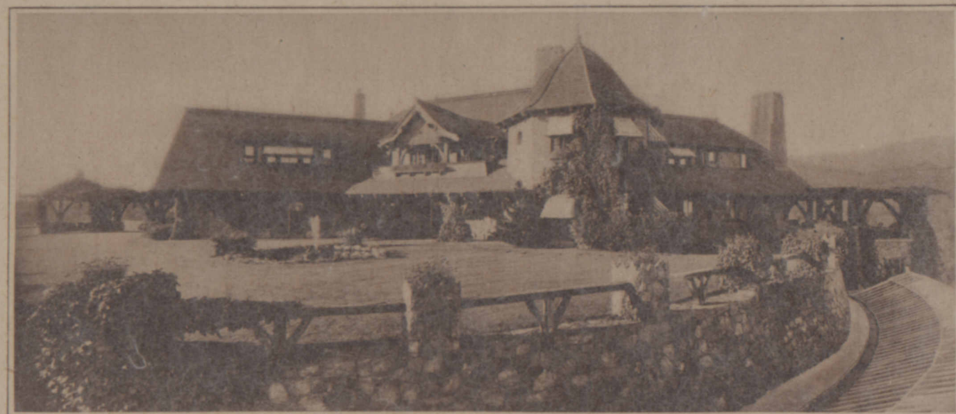
House of Lucknow