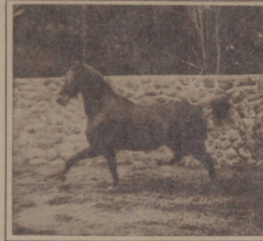
In the Paddock