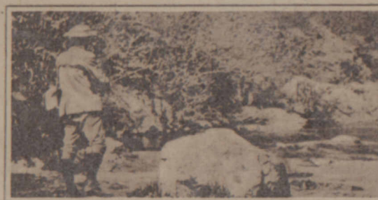
Excellent trout fishing on the estate