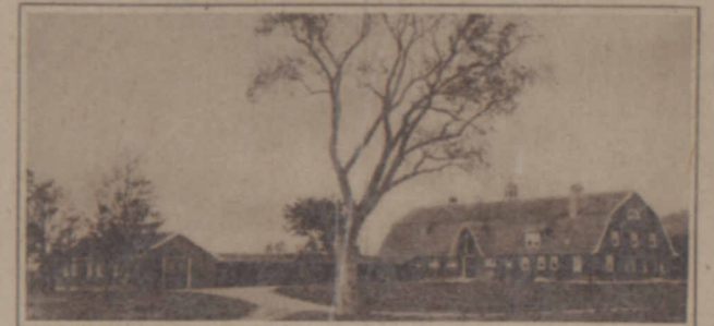
The farm property and buildings are nearly two miles from the house. There are three farmhouses and three farm barns, workshop and sheds