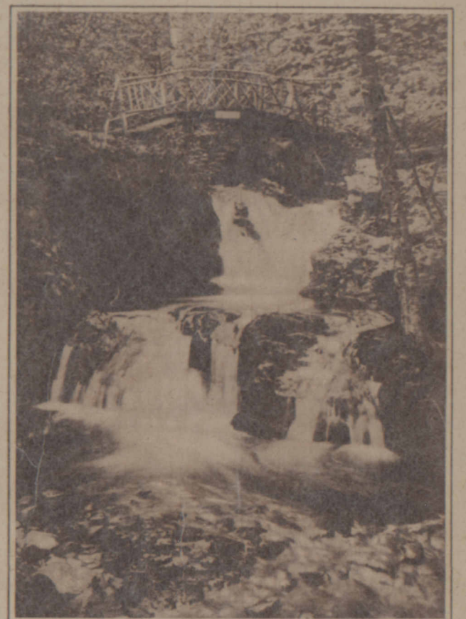
One of several beautiful falls on the estate within a few minutes' walk from the house