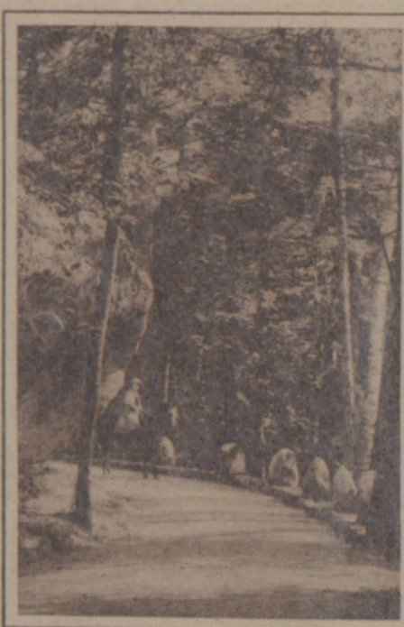
30 miles of riding roads on the estate

Below the house and within five minutes' walk is Shannon Lake, which empties into Shannon Brook, which flows through the estate for more than two miles.