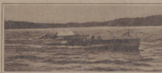
Motor boating on Lake Winnepesaukee is one of the great pleasures of the summer. The lake is 24 miles long and 4 miles from the house. The lake fishing is equal to the best; small-mouth black bass is the leading game fish caught