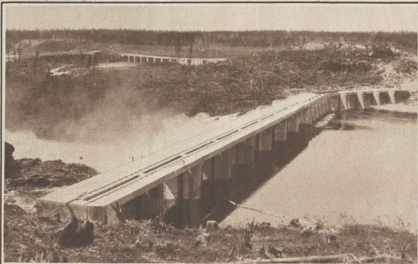
A VIEW FROM ALOFT—This photograph, from above the east bank, pictures the main dam, beyond which can be seen one of the secondary works.