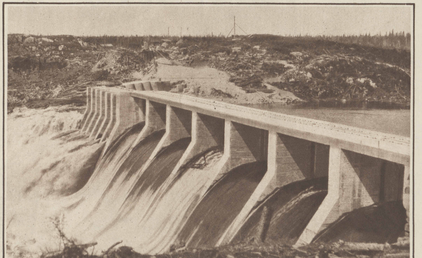
FROM THE EAST BANK—Another view of the main dam in the Tribune's power development on the Outardes river.