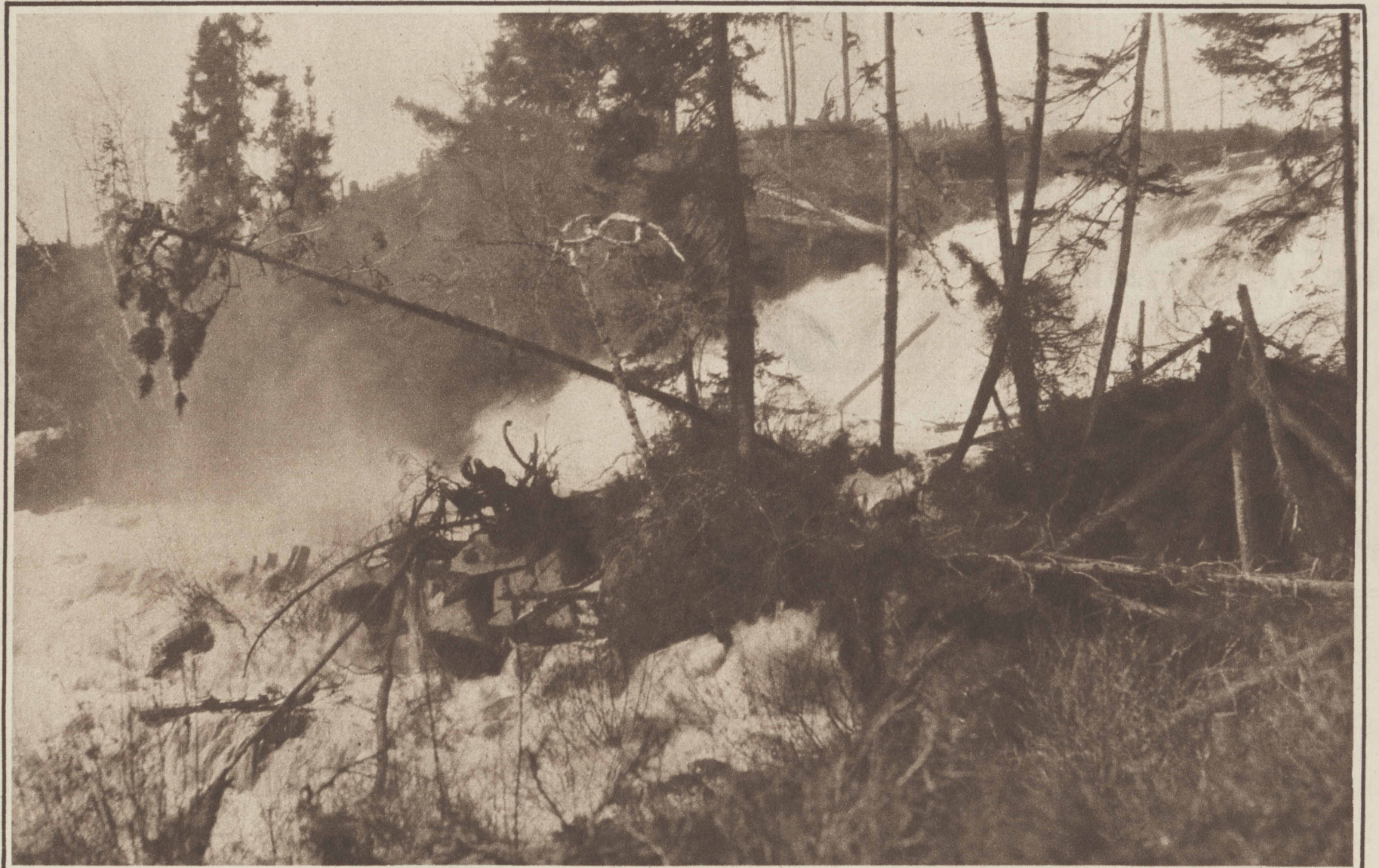
THE FORCE OF THE OUTARDES—This picture shows the torrents of flood waters from the Tribune's dam discharging through the by-pass canal.

TRIBUNE TIMBERLANDS —This map shows the location and extent of the Tribune's Canadian timber limits. 1—The Manicouagan river; 2—the Touloustouk river; 3—Shelter bay, terminus for logging operations in Tribune camp; 4—Franquelin, another Tribune port; 5—Rocky river; 6—Outardes river. The arrow indicates the site of the dam on the Outardes.