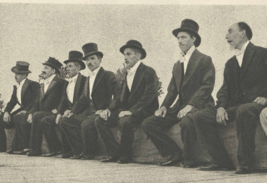
A few of the thirty gypsy senators who, by secret vote, chose the new king of the nation of nomads.

Then, much to the surprise of the spectators, appeared the Greek Orthodox metropolitan of Warsaw, Peter Theodorovich, who proceeded to crown and bless the new king. It was at the request of the premier, Gen. Felicjan Slawoj-Skladkowski, that the presence of the venerable priest was obtained.