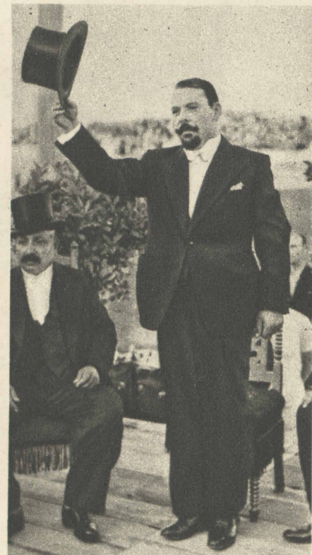
King John announced his own election. Here he is shown acknowledging the cheers of the crowd.