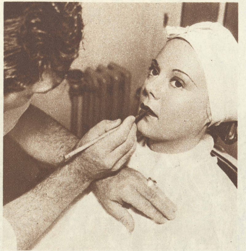
FINISHING TOUCH—Sonja Henje, the skating champion, makes up for a film test.