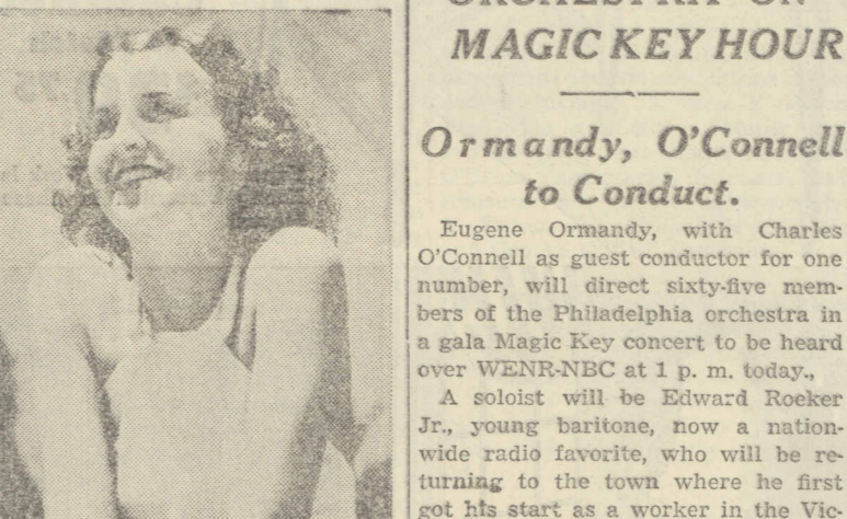
Marion Talley, one time operatic prima donna, now a svelte radio singer. She sings from Hollywood over WMAQ-NBC at 4 p. m. Sundays.