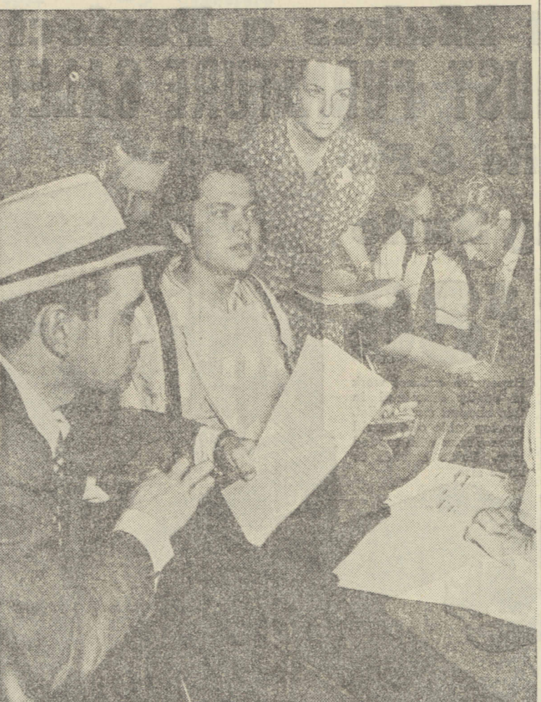
Orson Welles, boy wonder of the American stage, as he appears on the air Monday nights at 8 o'clock in the Mercury theater production "First Person Singular." WBBM is the local outlet.