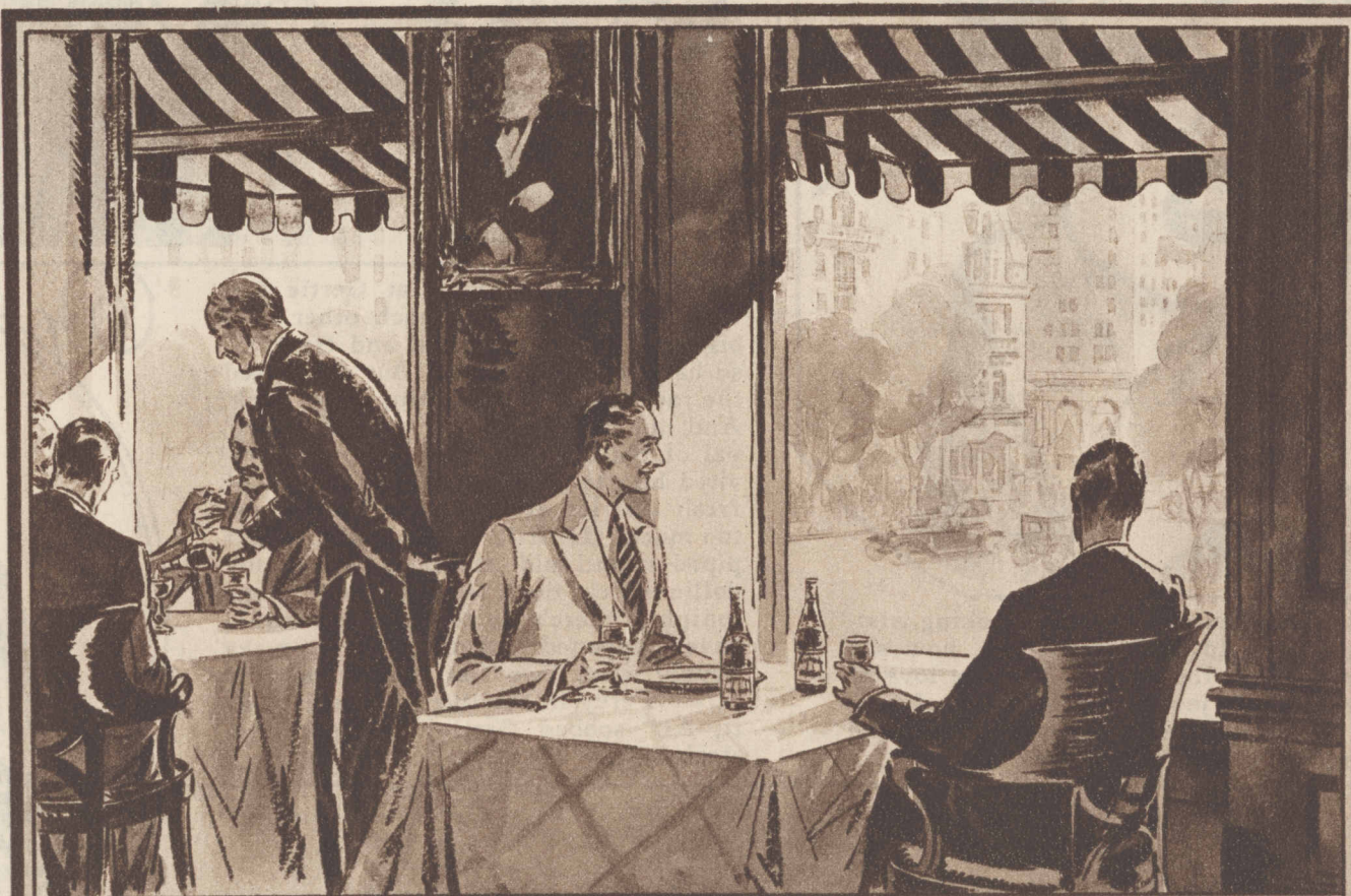
LUNCHEON BY A CLUB WINDOW

"Canada Dry" contains high-grade Jamaica ginger and other absolutely pure ingredients. It does not contain capicum (red pepper) and therefore it has no false bite, no unpleasant after-effect. No matter how warm the weather, you can drink as much of it as you want.