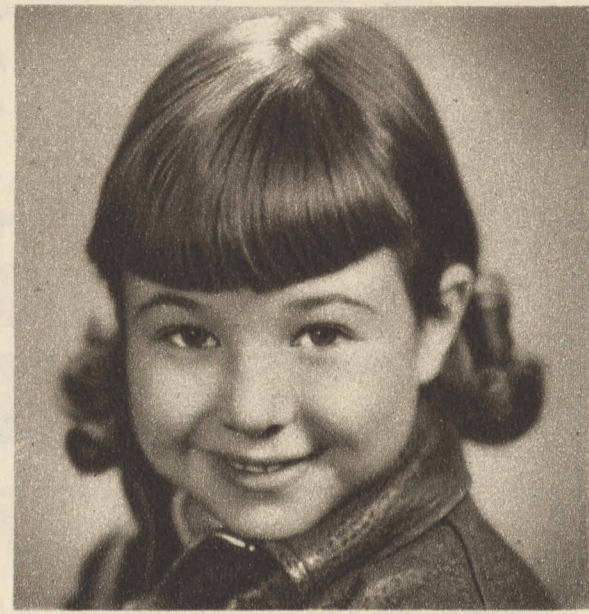
JANE WITHERS $1,000 a week