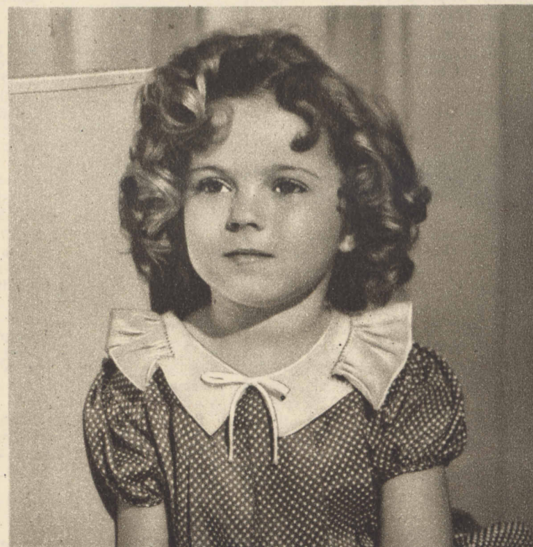
SHIRLEY TEMPLE $500,000 a year