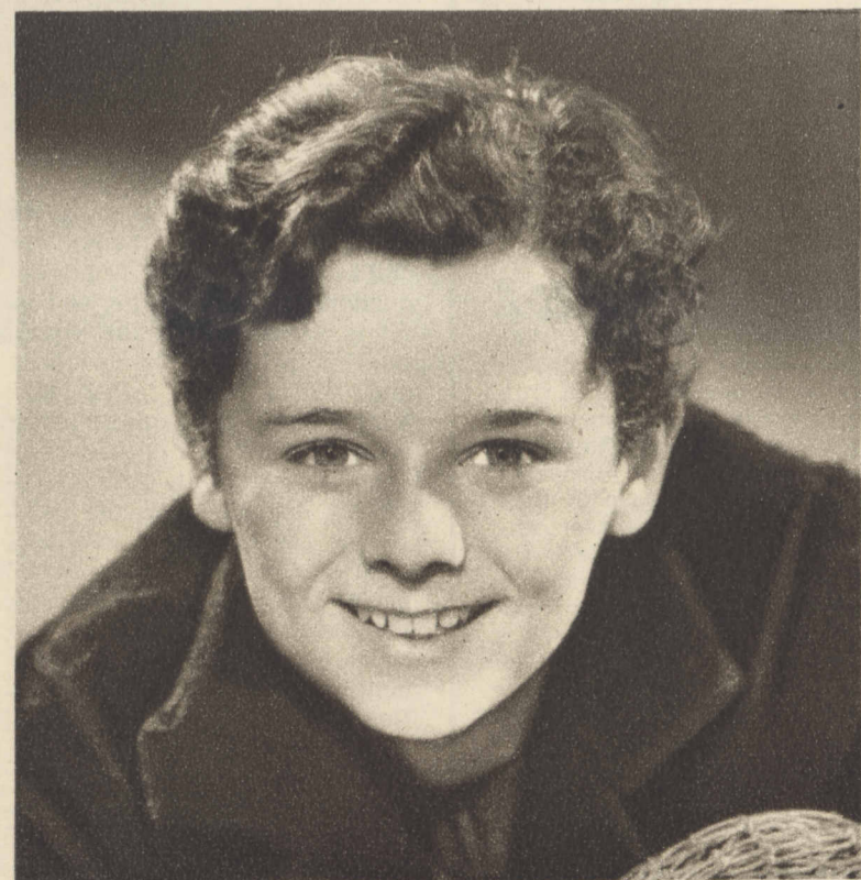
FREDDIE BARTHOLOMEW $1,500 a week

● Mary Miles Minter earned more than a million dollars and at her majority found little of it; and that she had to battle over in the courts. (Continued on page two.)