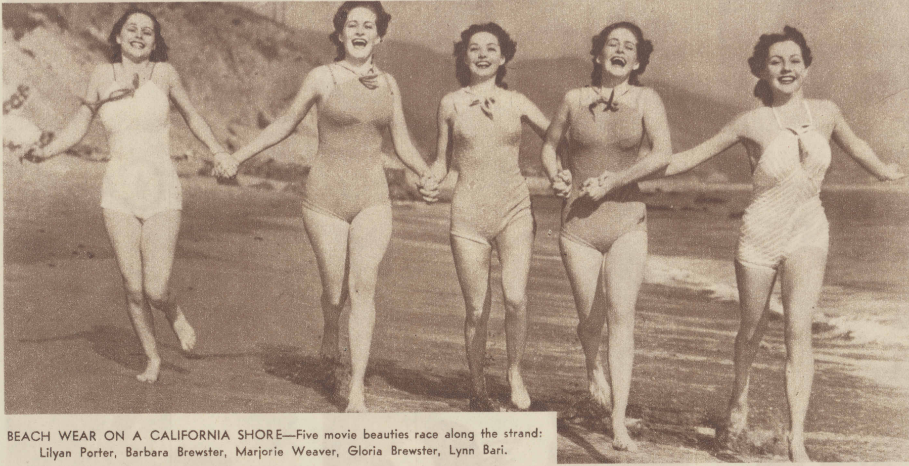
BEACH WEAR ON A CALIFORNIA SHORE—Five movie beauties race along the strand: Lilyan Porter, Barbara Brewster, Marjorie Weaver, Gloria Brewster, Lynn Bari.