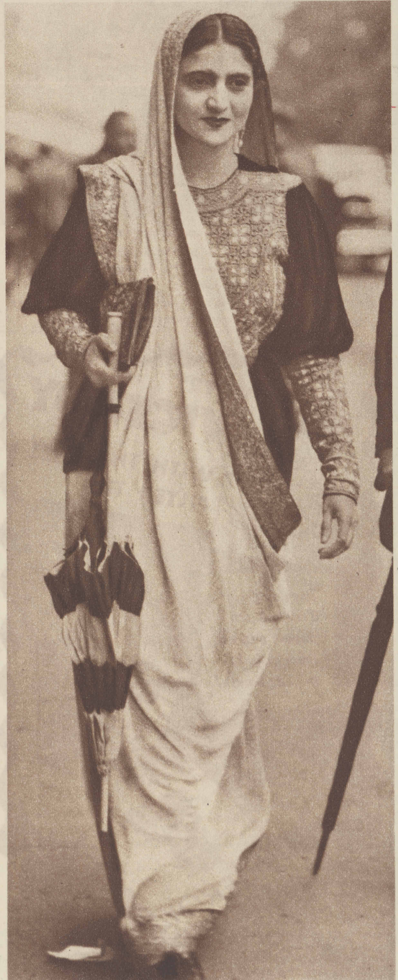
A FASHION FROM INDIA adds exoticism to the customary English style show at the Ascot races.