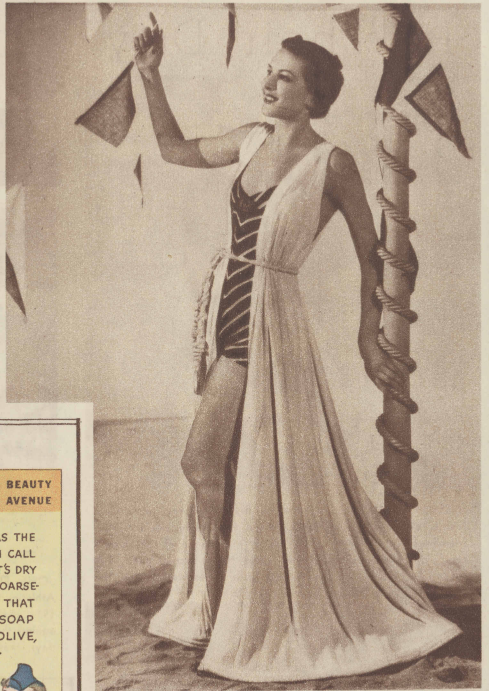
A PARISIAN BATHING FASHION designed by Maggy Rouff has a swim suit striped in navy and white, topped by a beach coat of white jersey.