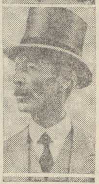
Sir Arthur Wauchop.

The governor spent the July 4 weekend at his office in the executive mansion, going over the bills.