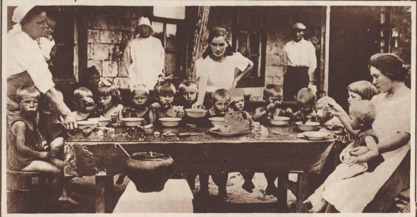
THE HAND THAT ROCKS THE CRADLE IS THE STATE in soviet Russia. These children get their noonday bread and soup in a governmental nursery at the village of Great-Kirsanowka while their mothers toil in factory and shop.