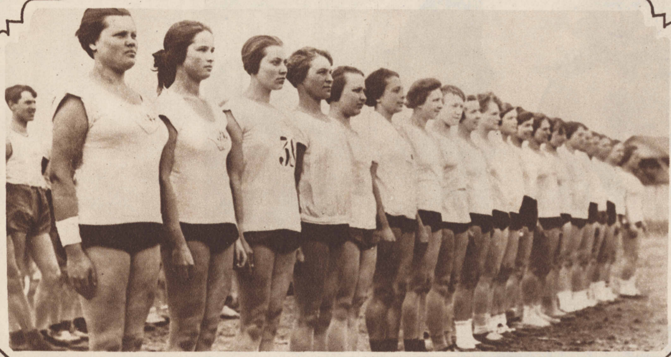
GIRL ATHLETES OF RUSSIA—These brawny women, sisters of the Amazons of the wartime death battalions, are phenomena of the present-day scene in soviet Russia. They are students at the state institute for physical culture at Moscow.