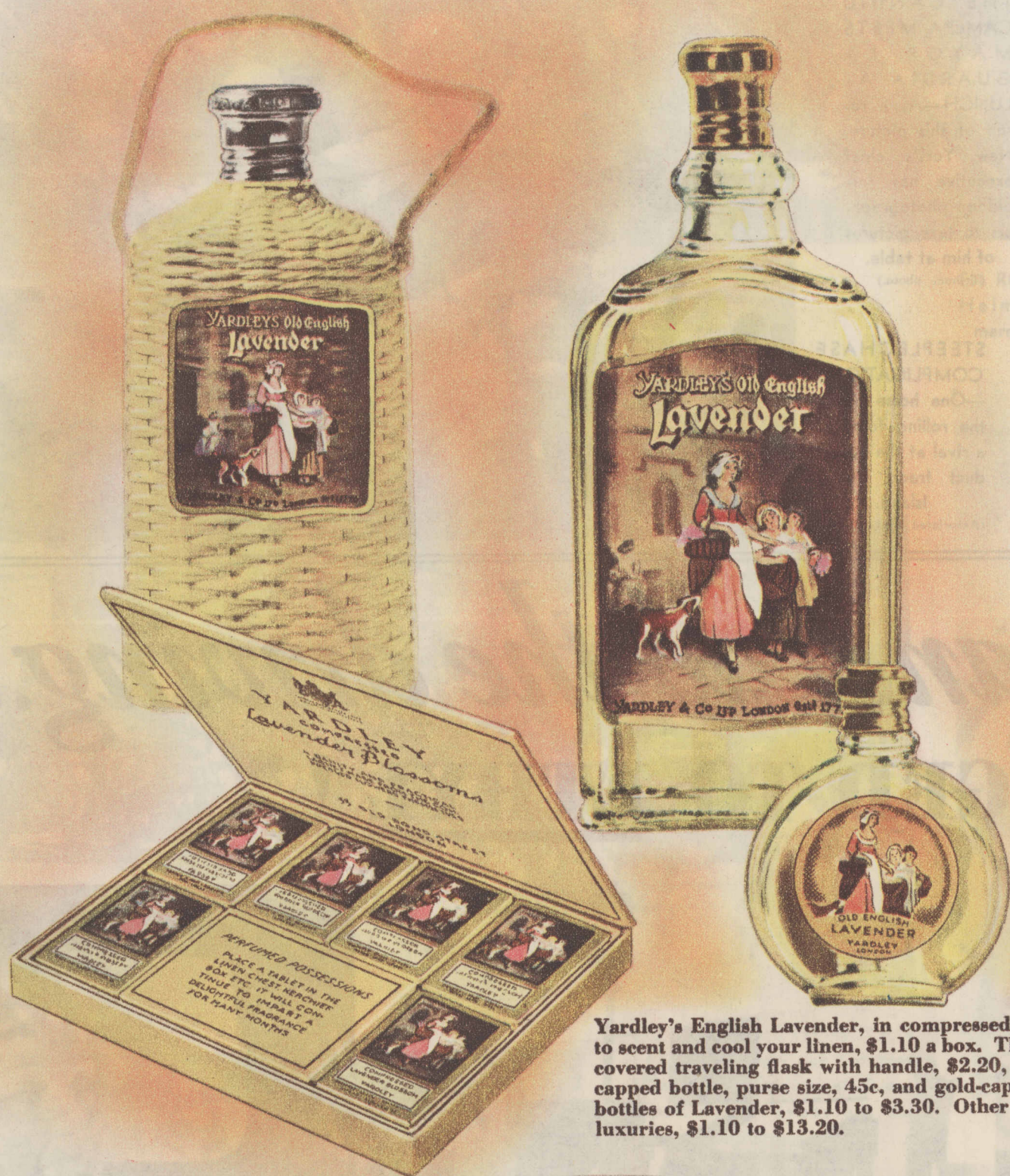
Yardley's English Lavender, in compressed blossoms to scent and cool your linen, $1.10 a box. The wicker-covered traveling flask with handle, $2.20, tiny gold-capped bottle, purse size, 45c, and gold-capped toilet bottles of Lavender, $1.10 to $3.30. Other Lavender luxuries, $1.10 to $13.20.