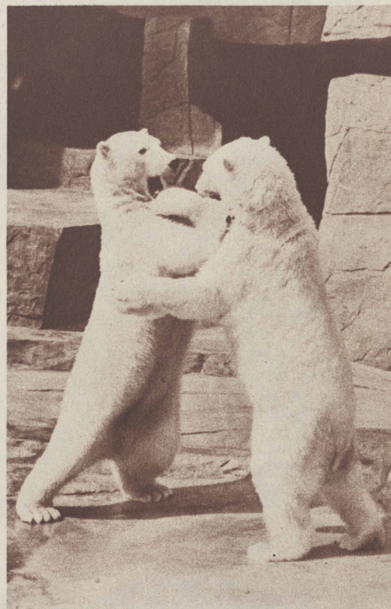
POLAR BEARS STAGE A TUSSE.

Animals in Action in the Cageless Enclosures at Brookfield.