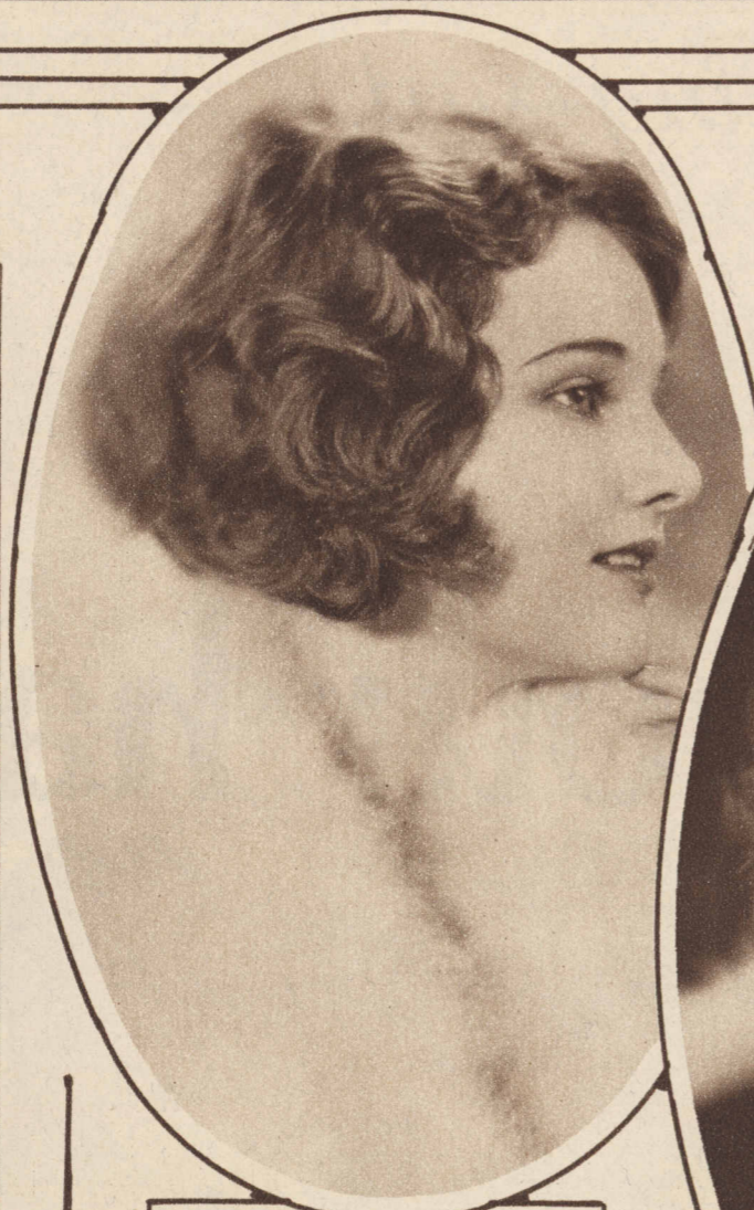
LOLA LANE. Recognize her? She's the girl who did a lot toward making "Speakeasy" what "Speakeasy" was—a film to conjure with.