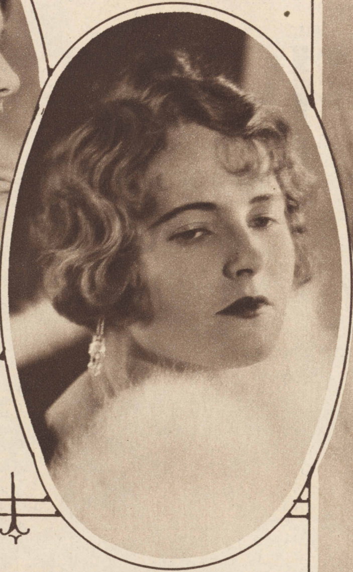
LOIS MORAN has just had a new picture taken. This is it. We liked it, and so pass it on to you. Accept it, with our compliments, for your albums.