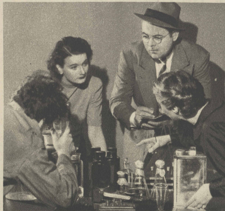
3 In Dr. Markham's laboratory, Peter Quill and Gail Carson listen to the housekeeper's story of the surgeon's dream: "... He thought the army could use the truth gas fighting Red Circle spies."