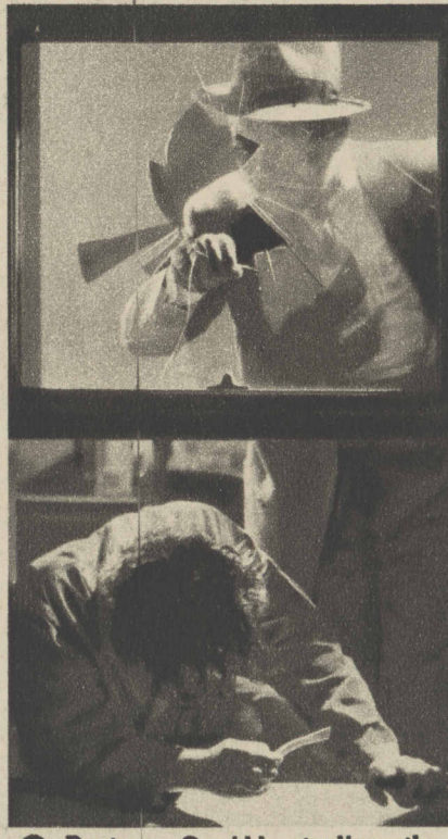
8 Peter Quill studies the broken glass on the OUTER sill. Abruptly, he wheels and begins ...