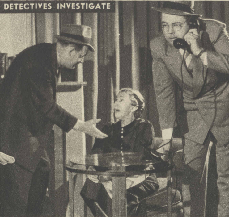
2 "He was experimenting with a new truth gas," Miss Prouty tells Detective Flannery. "He was going to turn it over to the army." Detective Cassidy seizes the phone: "This is a case for Peter Quill!"