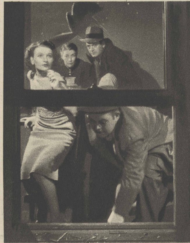
5 Crashing glass! A steel ring clangs upon the floor; to it a note is tied: "Don't start nothing you can't finish. We're watching you. The Red Circle."