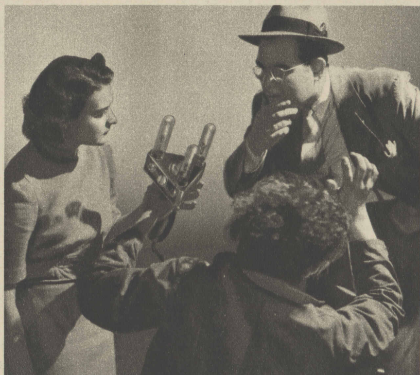
12 "Prouty wrote the note with a pencil she used at the telephone pad; that was determined by my portable X-ray while the note occupied you. But now Prouty is finished as a tool of the Red Circle. The truth gas still is safe for the army!"

All names used in "The Return of Peter Quill" are fictitious.