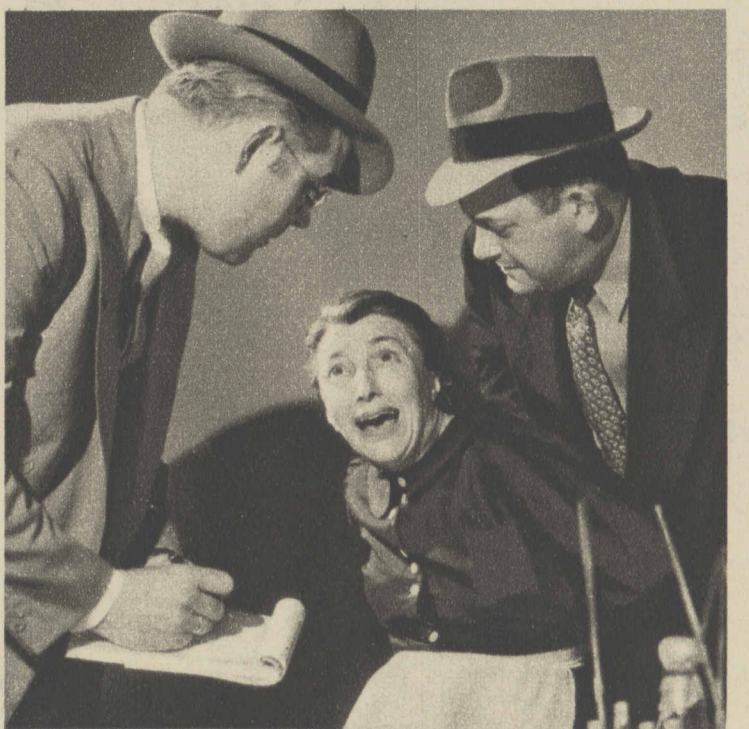
10 "... they make me give myself away. I was stealing them; I wanted to sell the formula to the Red Circle. But the doctor found out. He gave me truth gas and made me confess. He was going to call the police ..."