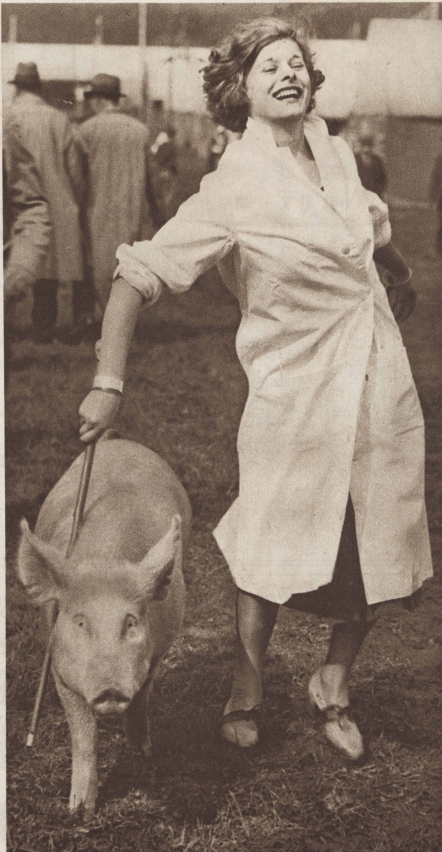
ROUNDING UP A PORKER during a London agricultural show.