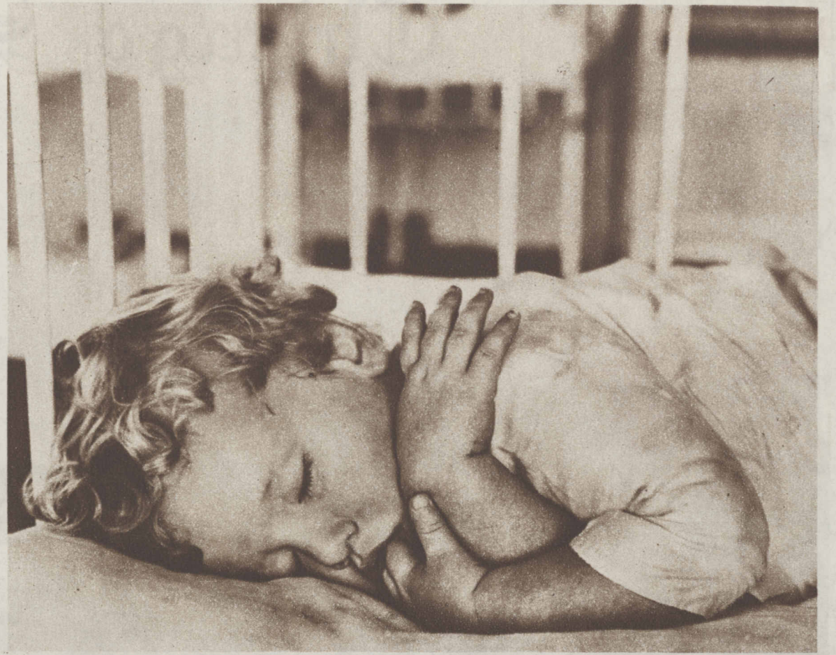
CHILDHOOD ASLEEP IN A MELBOURNE, AUSTRALIA, HOSPITAL.