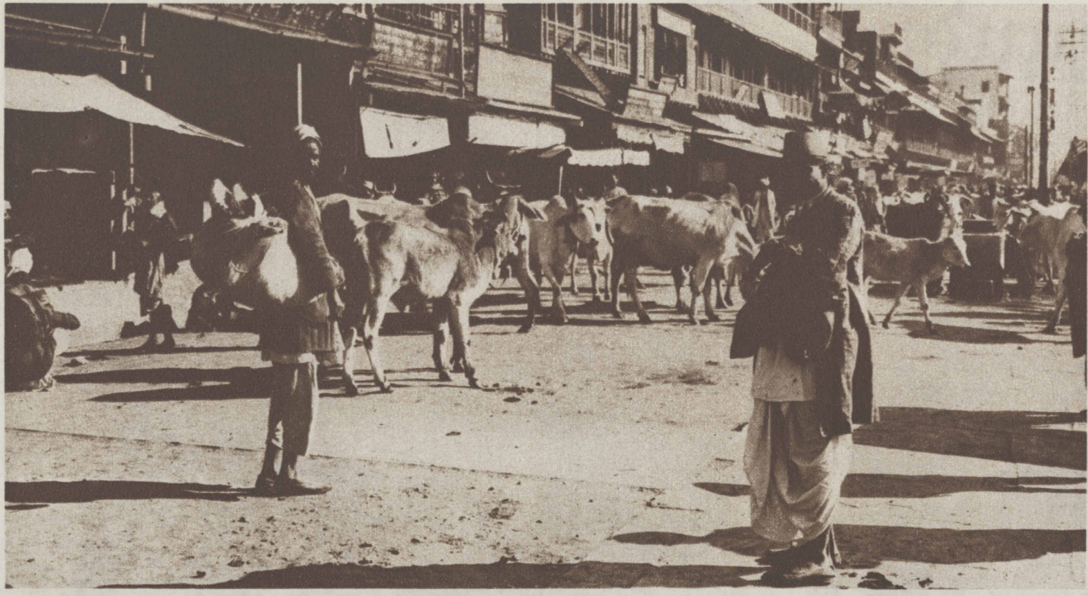
STREET SCENE IN DELHI, INDIA.