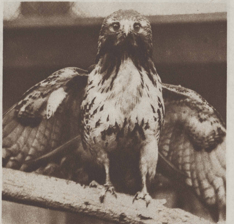
THE RED TAILED HAWK POSES AT THE PHILADELPHIA ZOO.