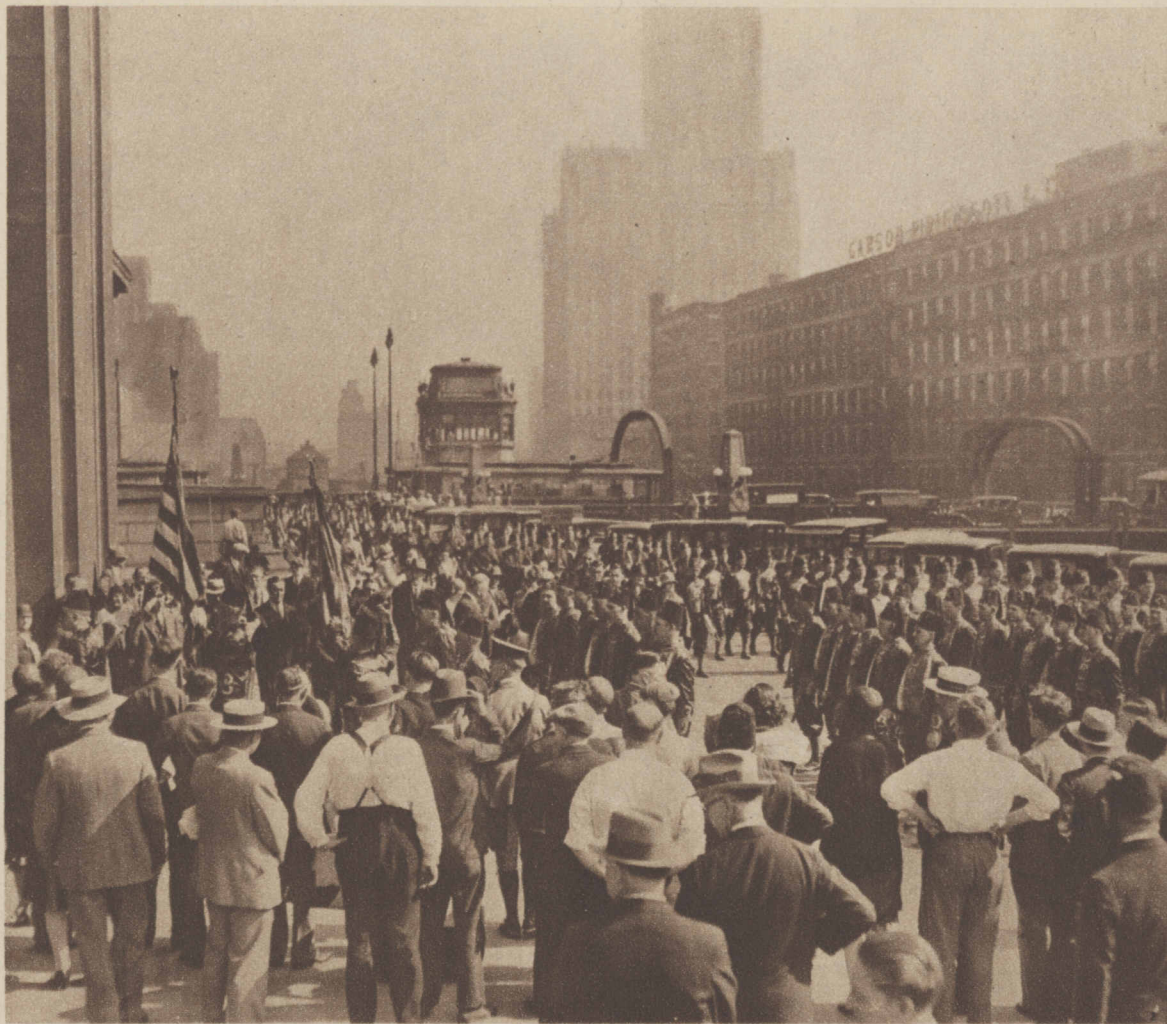
GOING OUT —Into the jaws of the Union Station marched the noble 800, shriners all, to tunes from somewhere east of Suez and to others from somewhere west of the public library. At the end of an exotic march through the streets of Chicago, they were en route to the Imperial council convention at Toronto. (Tribune photo.)

"YOUR HAIRDRESSER" Henry's Studio SUITE 431 PITTSFIELD BUILDING FRANKLIN 9801