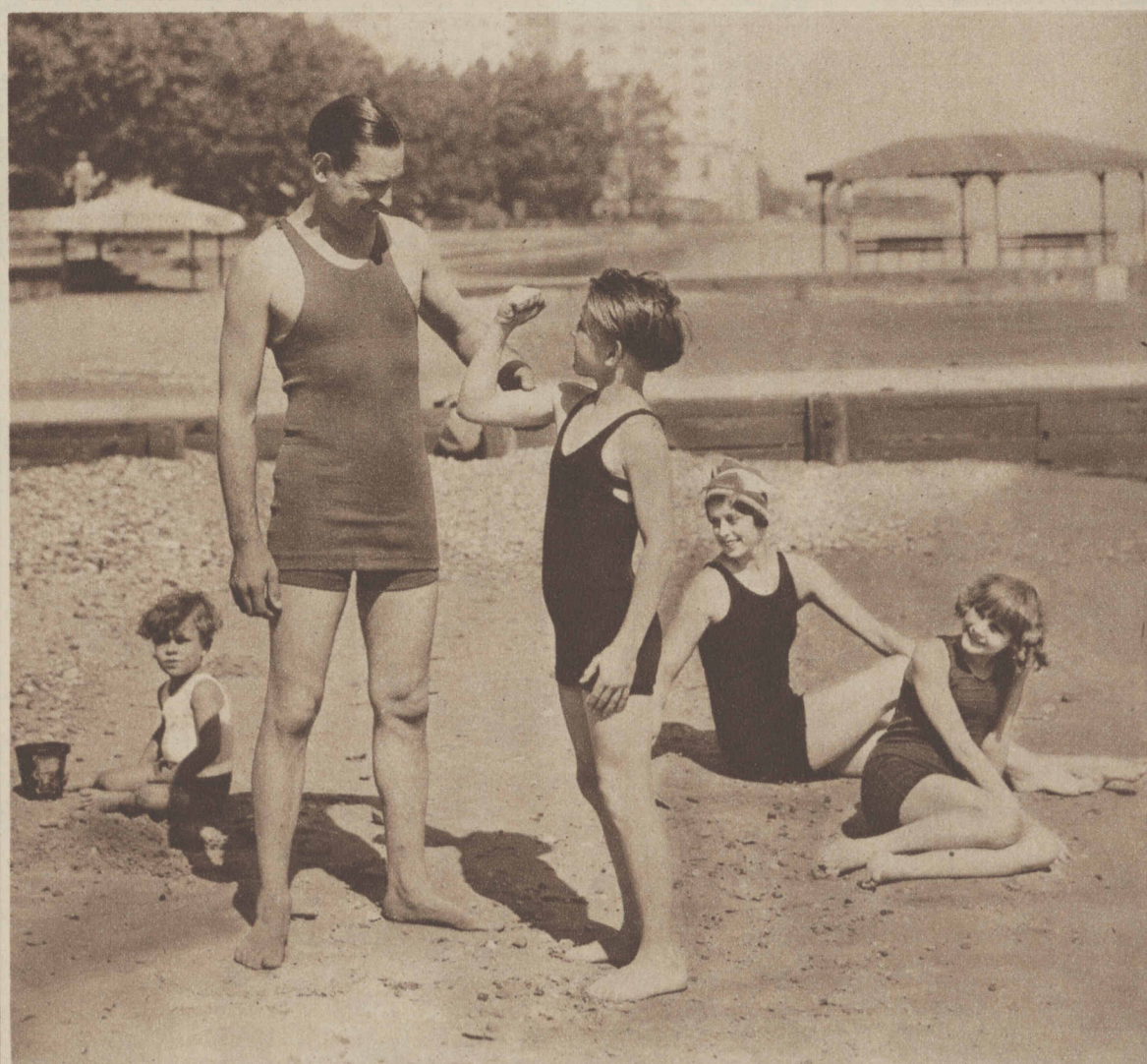
AND CHICAGO DRESSES DOWN —Left to right, we have baby, dad, brother, mother, and sis in new fashions currently favored hereabouts. Entering the joy season along the lake front, the family turns off the radio in off hours nowadays and adjourns to the beach en masse in some such minimized tailoring.