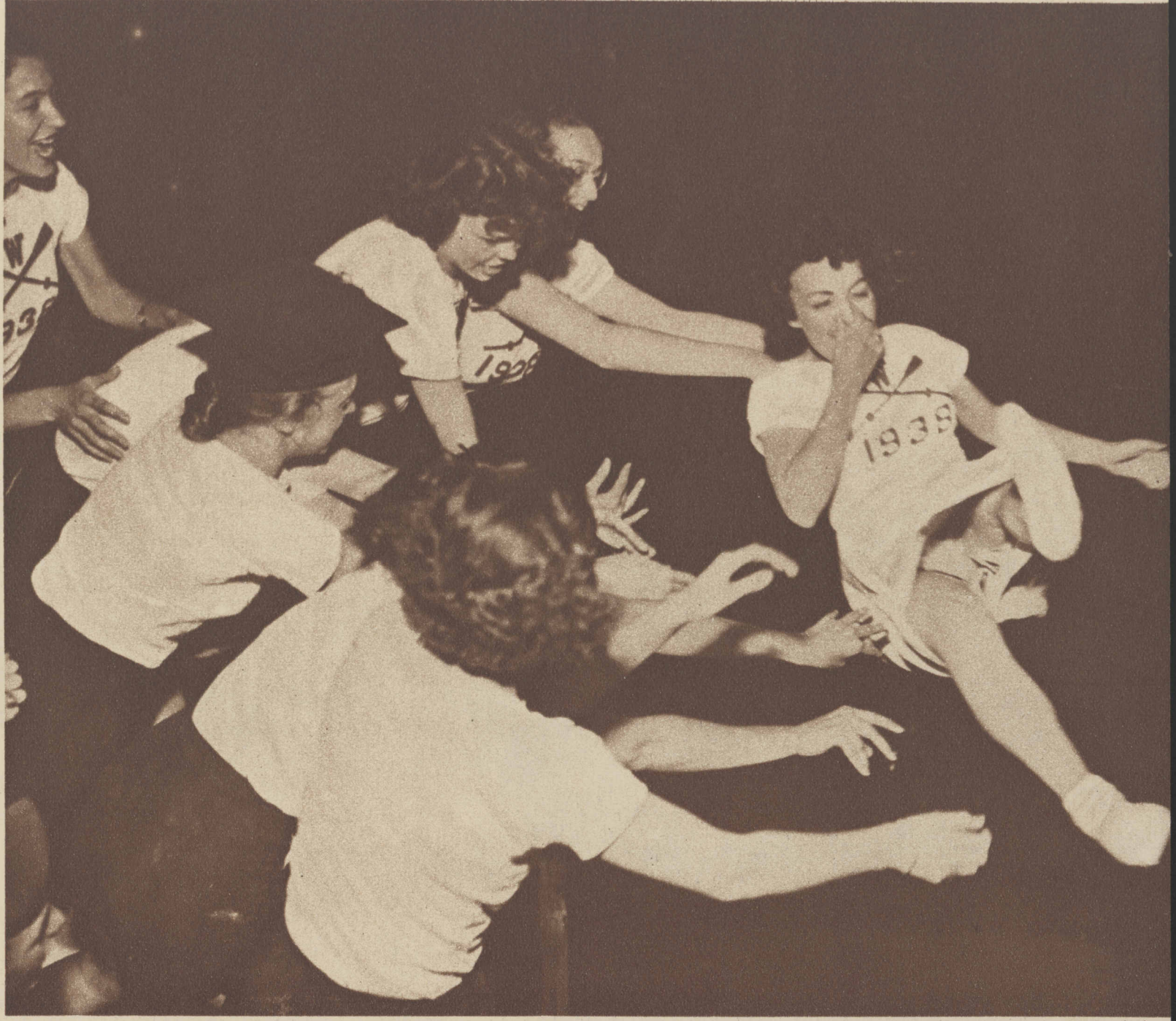
WELLESLEY OARSWOMEN DUCK THEIR COXSWAIN TO CELEBRATE A VICTORY.