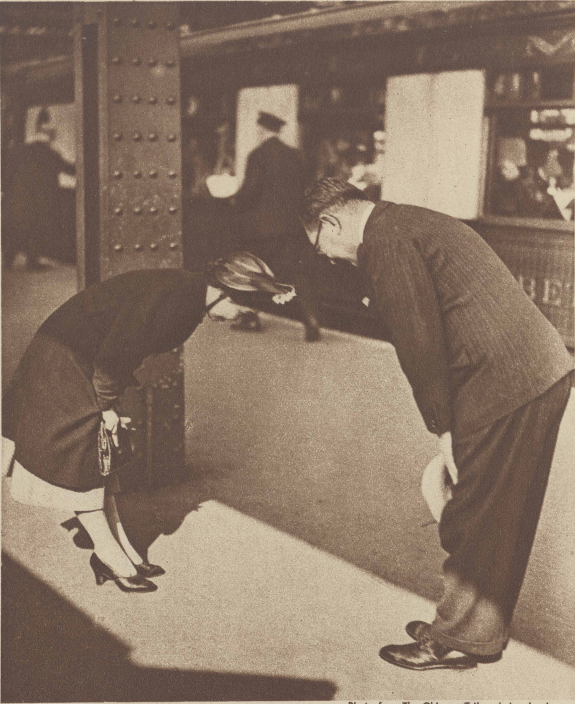
A FRIEND BIDS A JAPANESE DIPLOMAT GOOD-BY AT TOKIO.