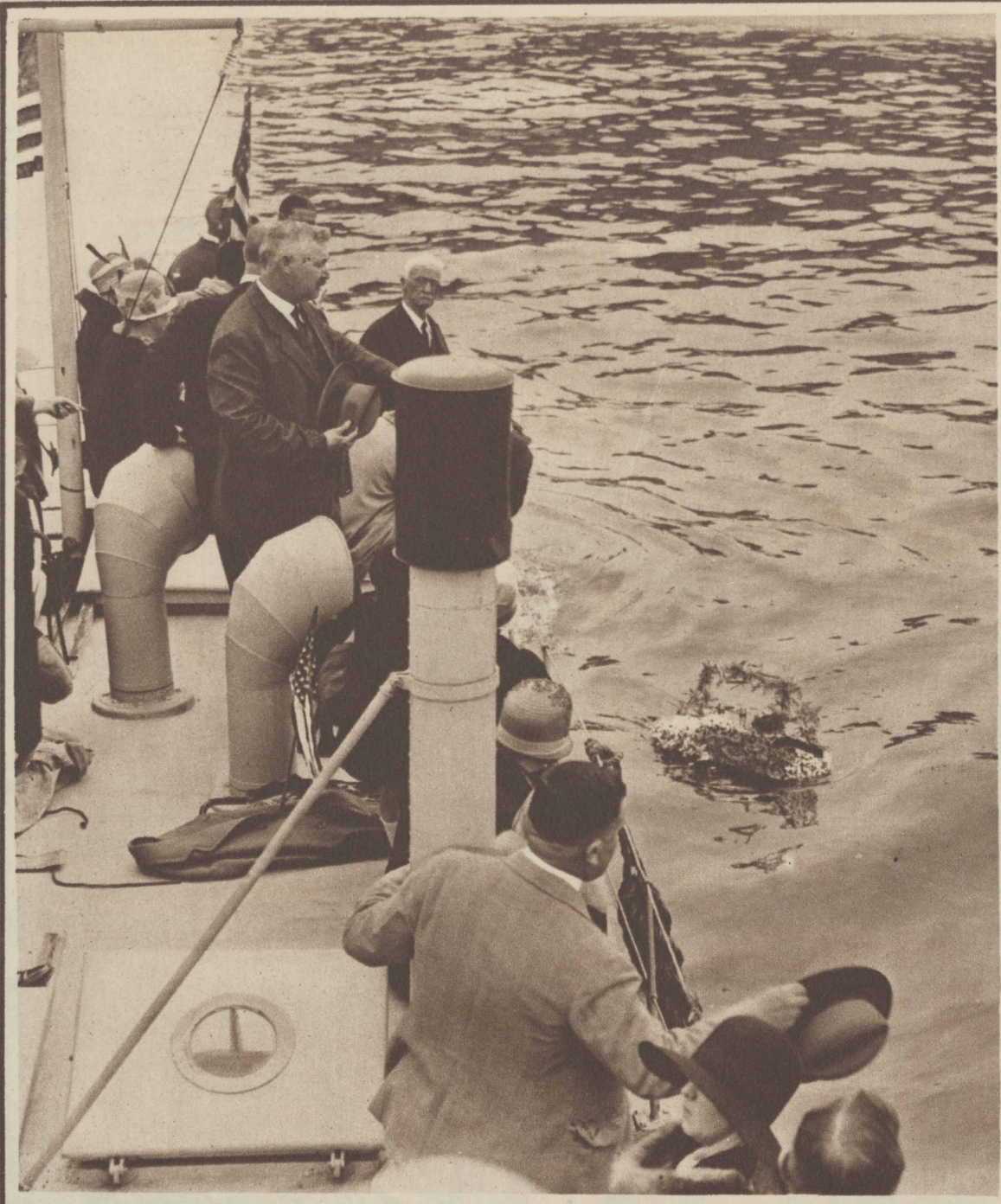
A MARINE MEMORIAL DAY—A miniature ship of flowers was set sail, to the accompaniment of benediction and taps, at memorial services for Staten Island men who perished in the Spanish-American war. The scene was pier No. 8, Tompkinsville, New York City.