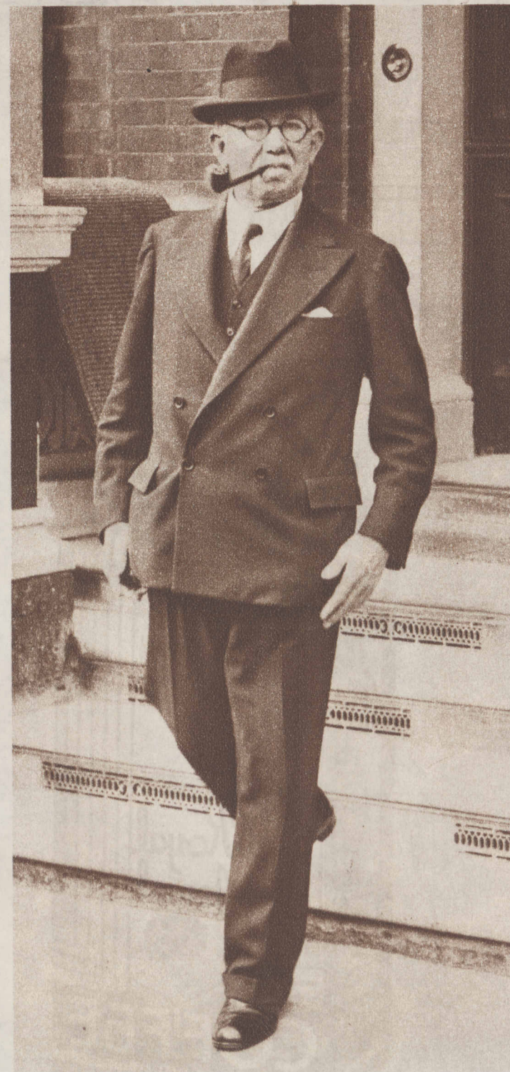
CASUALTY OF ENGLISH POLITICAL SCANDAL—J. H. Thomas, who resigned as British colonial secretary following investigation of leaks in governmental budget secrets, departing from his London home.