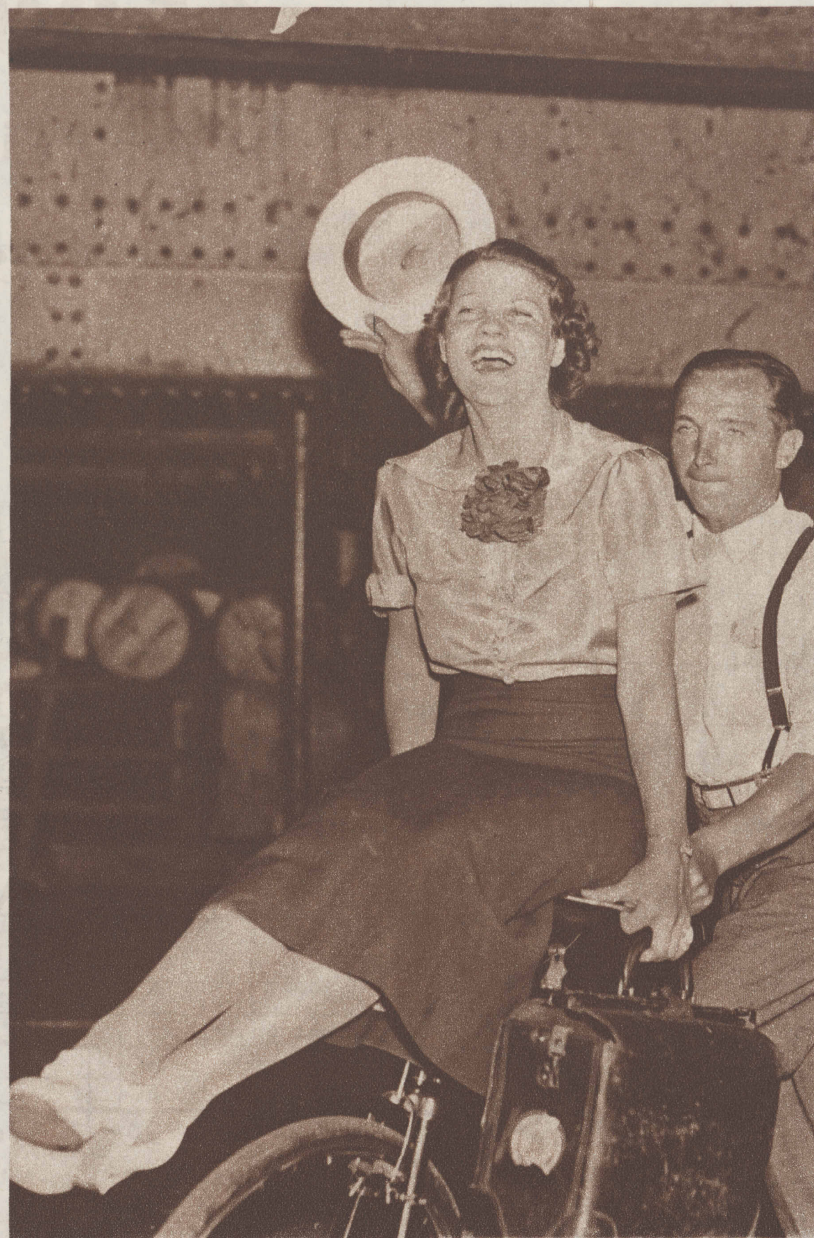
NO MORE SPEEDING? Returned from a Caribbean honeymoon, Rep. M. A. Zioncheck (Dem., Wash.) and his bride exhibit a bicycle which the congressman says they may use to minimize difficulties with traffic police.